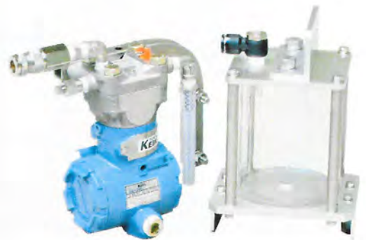
Electronic Level Sensing System TL-300B