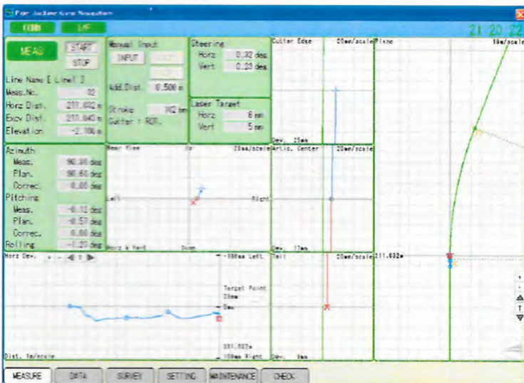
Line Management Screen