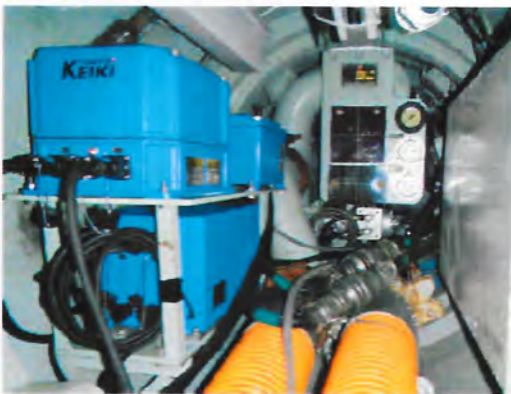
Gyrocompass (Inside machine)

The Gyro Guidance System "PN series" provides the operator with useful real time navigational data including exact 3D machine attitude and position information which aids in minimizing deviation from the designed centerline.