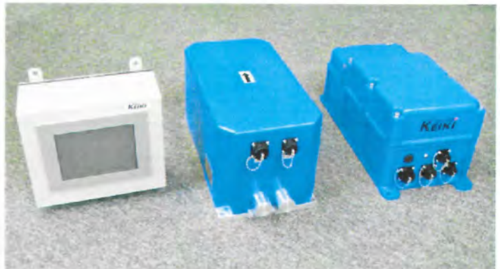
Fiber Optic Gyrocompass for Tunnel TMG-12F