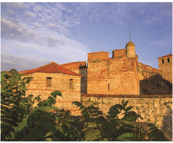
DAY 7 ROUSSE – GIURGIU, ROMANIA

Explore Vidin, one of Bulgaria's oldest cities, and surrounding areas with a choice of excursions. Discover Baba Vida Fortress, the largest preserved medieval castle in Bulgaria. Alternatively, visit a local home for a demonstration of traditional Bulgarian yogurt and Banitsa, a pastry you will also get to make. You also have the choice to bike through Vidin and to the castle. (B,L,D)