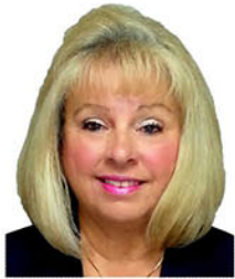
Multi Million Dollar Producer