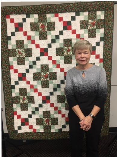
Guild Raffle quilt winner