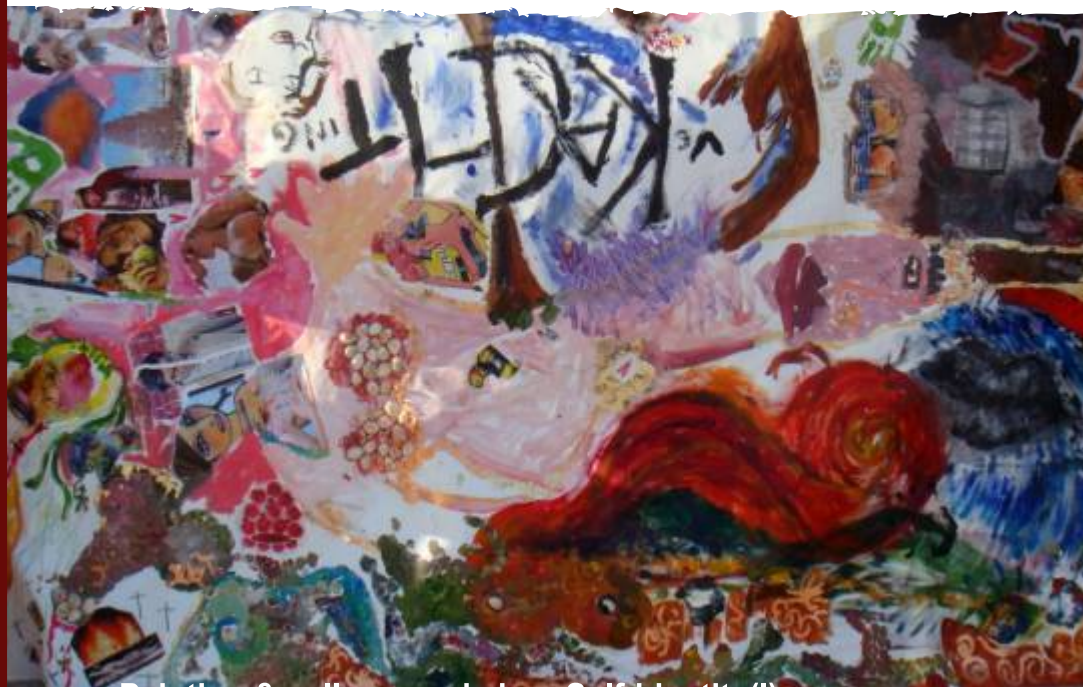
Painting & collage workshop Self-identity(I)