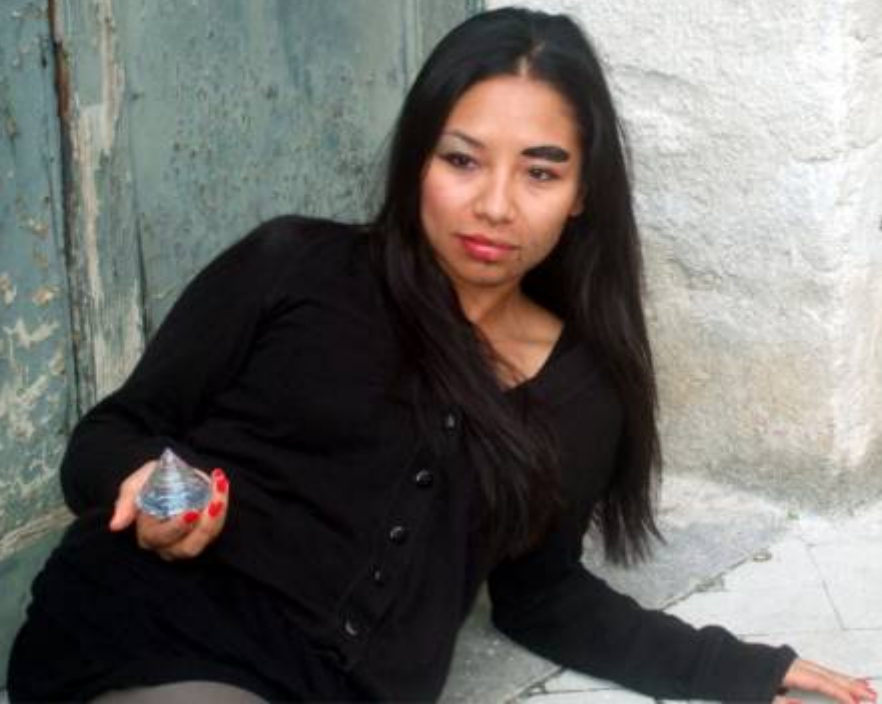
Photography workshop (Rasa)