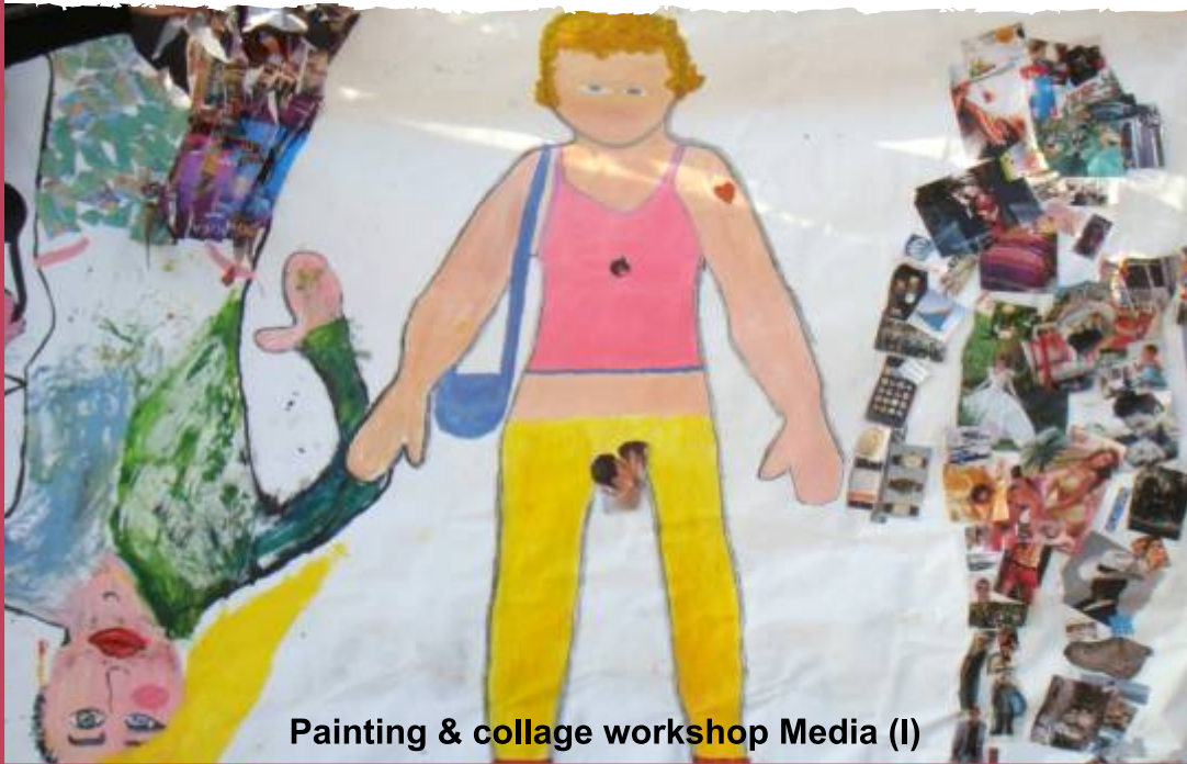
Painting & collage workshop Media (I)