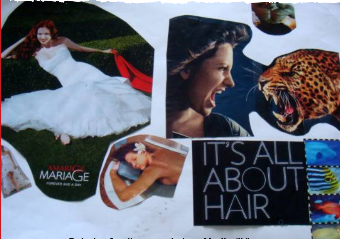
Painting & collage workshop Media (IV)