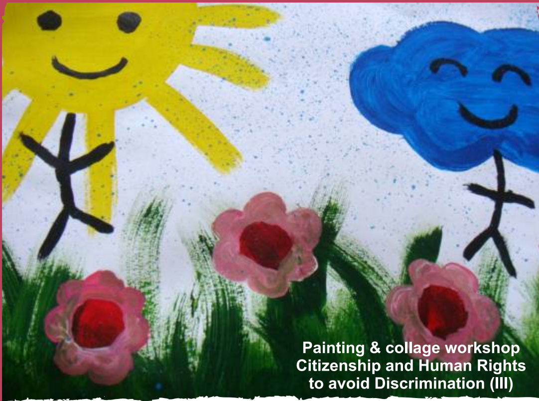
Painting & collage workshop Citizenship and Human Rights to avoid Discrimination (III)