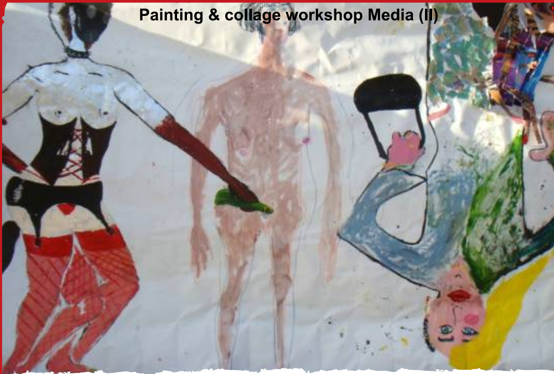
Painting & collage workshop Media (II)