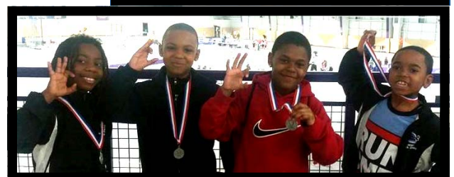
8 & Under Boys Relay