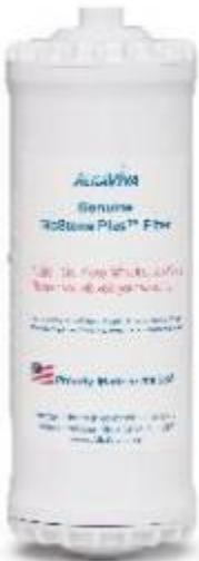
AlkaViva (Jupiter) BioStone Plus 3.0M Ionizer Filter