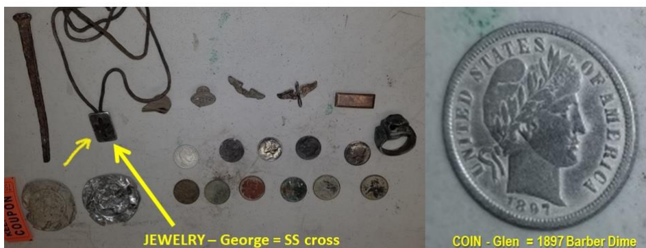
JEWELRY – George = SS cross