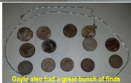
Gayle also had a great bunch of finds