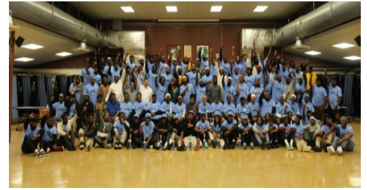
Israelite Men's Association (IMA) Created Aug 17, 2016