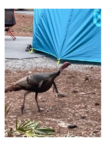
DISNEY TURKEY: REAL OR ANIMATRONICS?

After dinner everyone went to Disney Springs so that they could get themselves souvenirs. The whole group met at Hollywood Studios so we could all ride the Tower of Terror together before we left. After this incredible and thrilling dropper