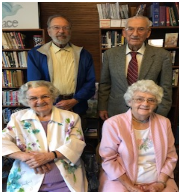
Remembering our faithful elders!