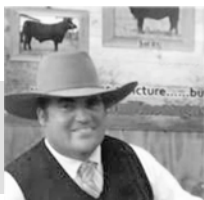
Ben Hill Market Access