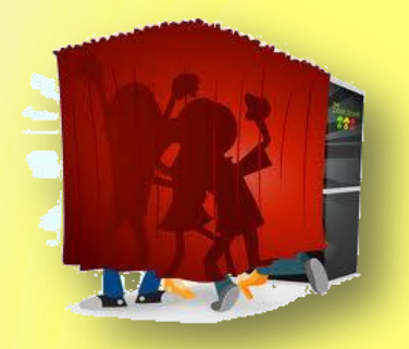
Photo Booth $400 for 1<sup>st</sup> 2 hours $100 per hour thereafter (customized with your logo)

Small Midway Games - $40 per game per event