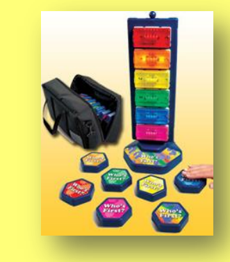
Trivia Contests / Buzzers $200 for 1<sup>st</sup> 2 hours $75 per hour thereafter (A mini game show! Comes with optional Game Board)

Gaming Station $300 for 1<sup>st</sup> 2 hours $75 per hour thereafter (Xbox/Kinect – Call for Multiple Stations)