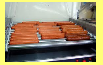
Hot Dogs $3 per hot dog + $50 per hour (includes ketchup/mustard/buns)

Cotton Candy $200 for 1<sup>st</sup> 2 hours $100 per hour thereafter (includes unlimited supplies)