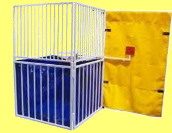
Dunk Tank $300 for 1<sup>st</sup> 2 hours $75 per hour thereafter (you provide the water)

Photo Booth $400 for 1<sup>st</sup> 2 hours $100 per hour thereafter (customized with your logo)