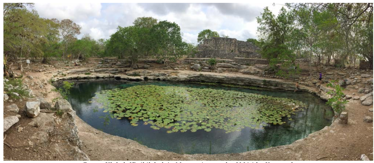
Cenote Xlakah [Dzibilchaltún Mayan site, north of Mérida, Yucatan]