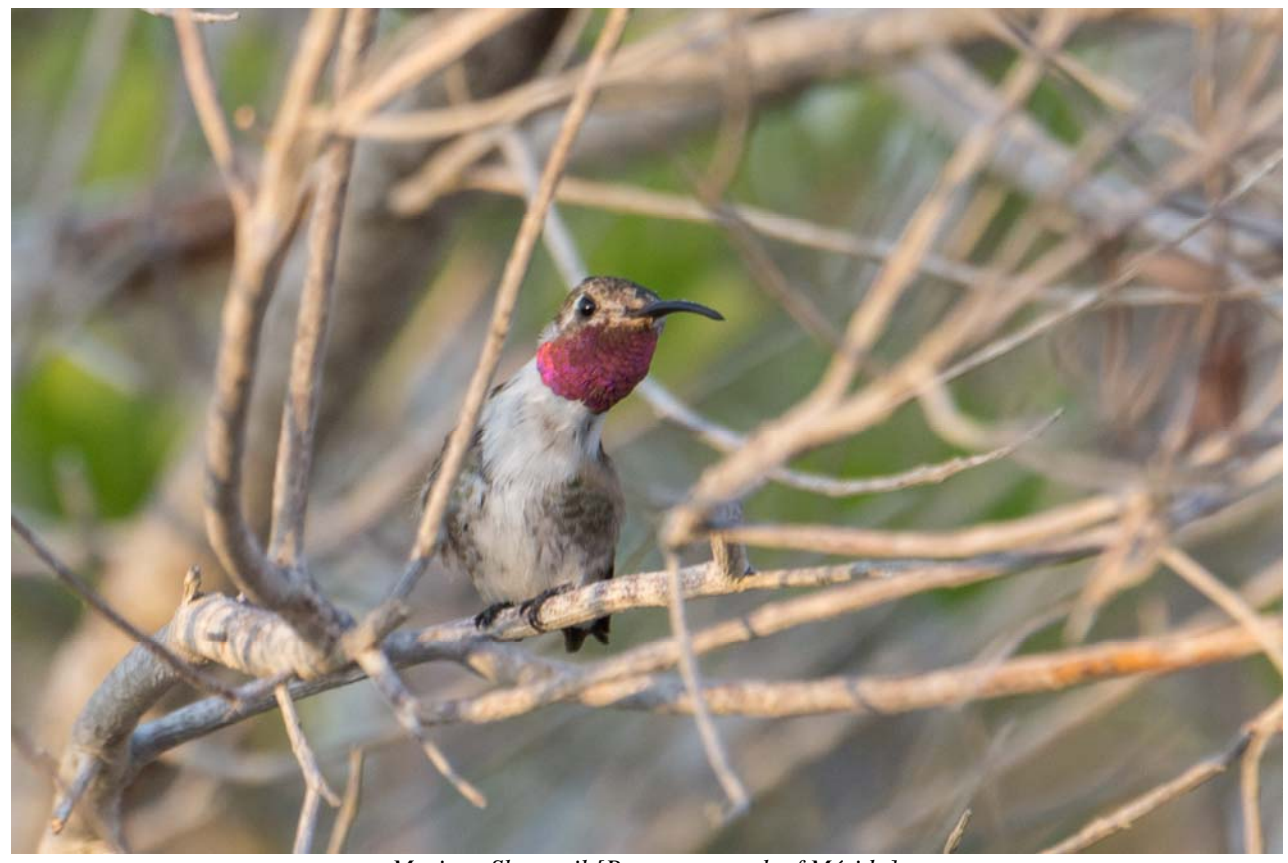
Mexican Sheartail [Progreso, north of Mérida]