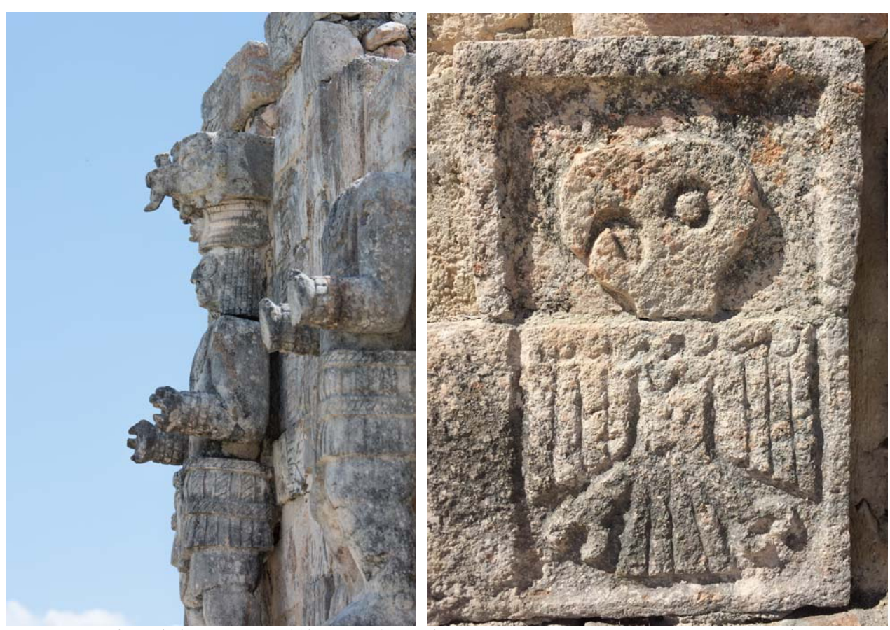
Statues at the Kabáh Mayan site [20km east of Uxmal]; Parrot (or Macaw?) carving [Great Pyramid, Uxmal]