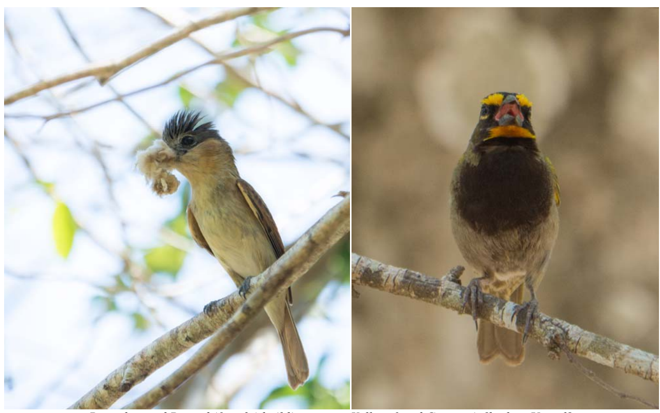
Rose-throated Becard (female) building a nest; Yellow-faced Grassquit [both at Uxmal]