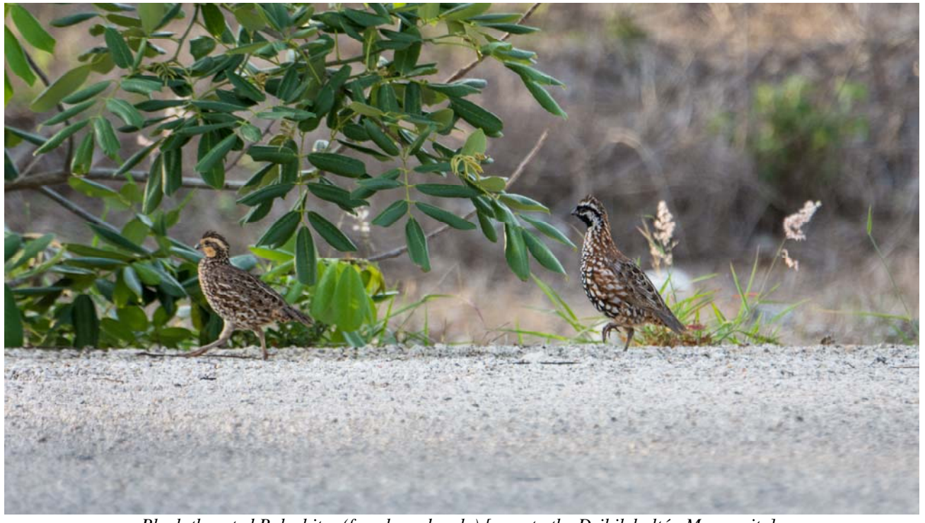
Black-throated Bobwhites (female and male) [near to the Dzibilchaltún Mayan site]