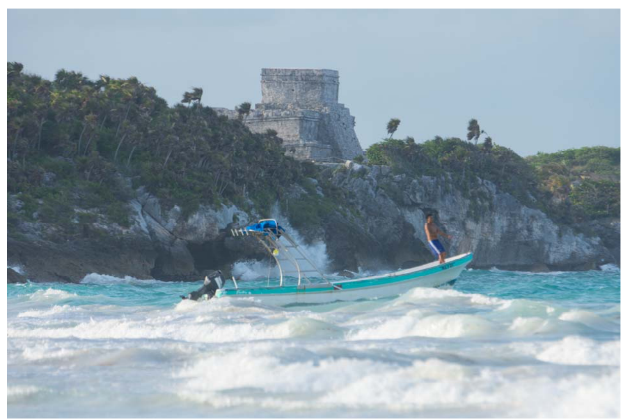
Tulum Mayan site [Tulum, Quintana Roo]