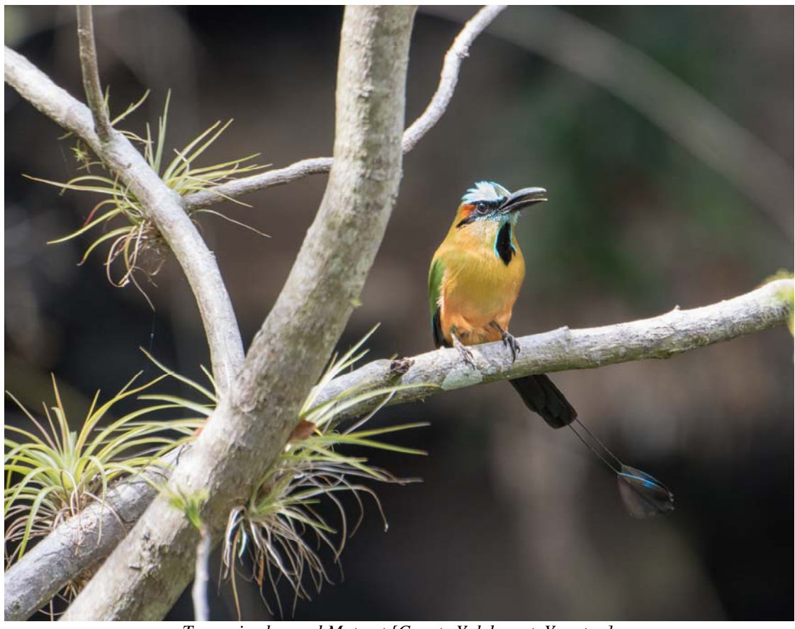
Turquoise-browed Motmot [Cenote Yokdzonot, Yucatan]