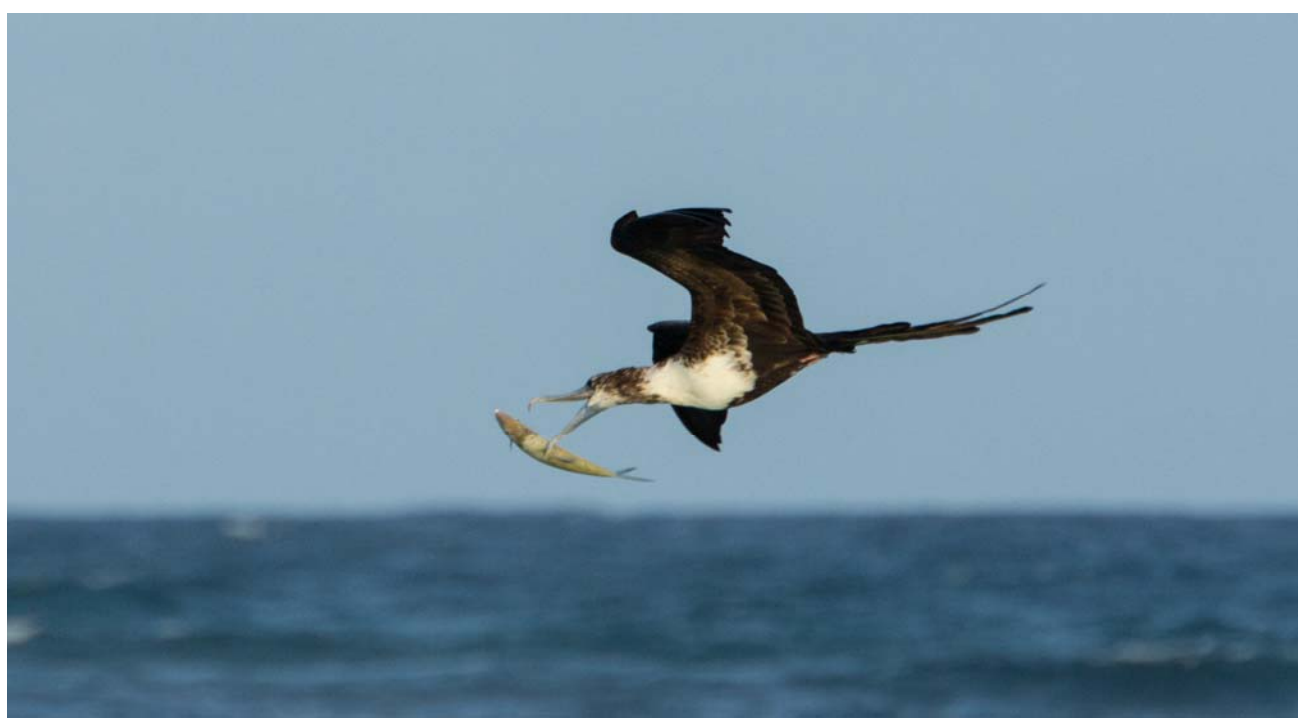
Magnificent Frigatebirds playing with an unidentified fish that proved too large to eat [Tulum, Quintana Roo]