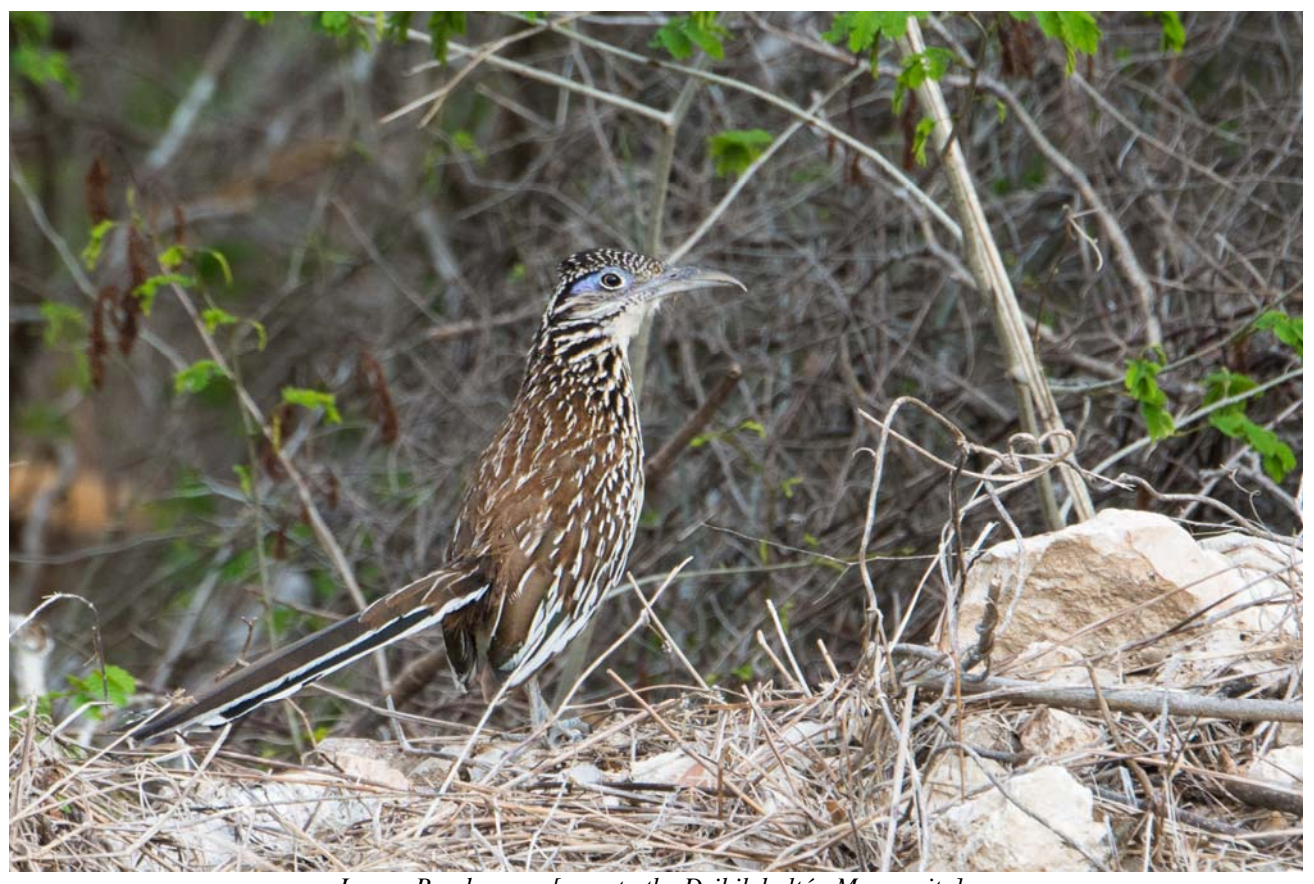
Lesser Roadrunner [near to the Dzibilchaltún Mayan site]