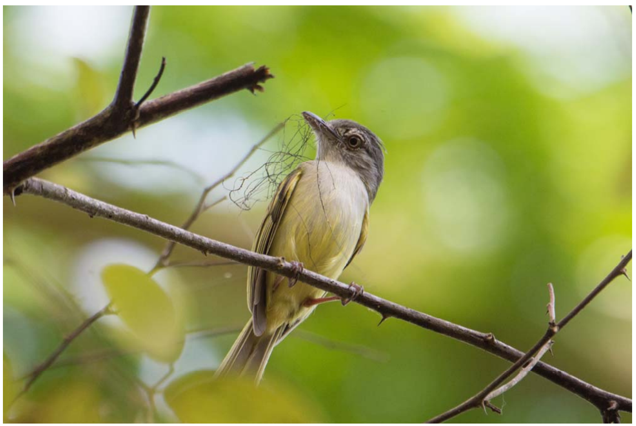
Yellow-olive Flycatcher with nest material at the Muyil Mayan site [near Tulum, Quintana Roo]