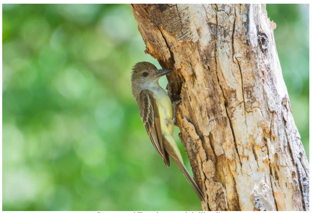
Brown-crested Flycatcher at nest hole [Uxmal]