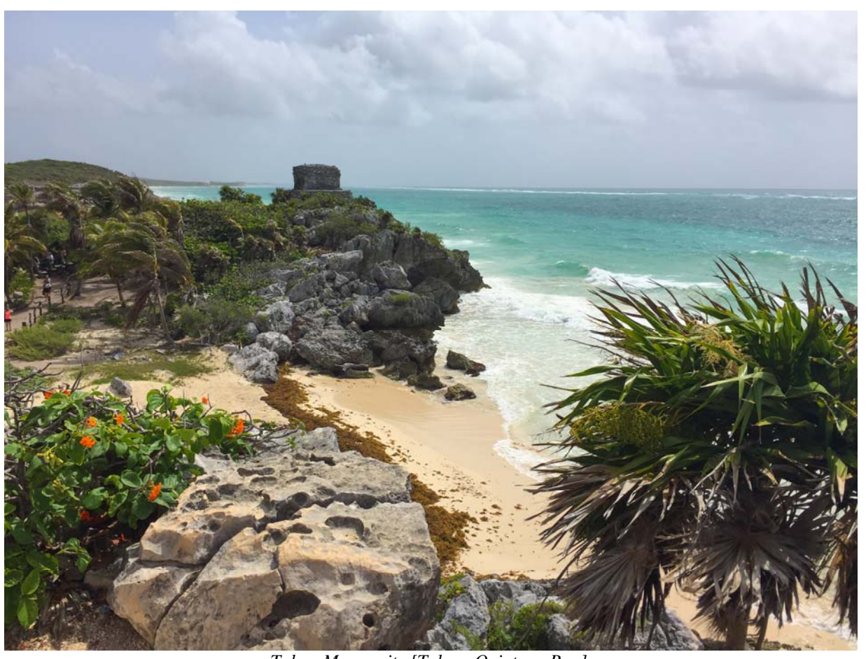
Tulum Mayan site [Tulum, Quintana Roo]