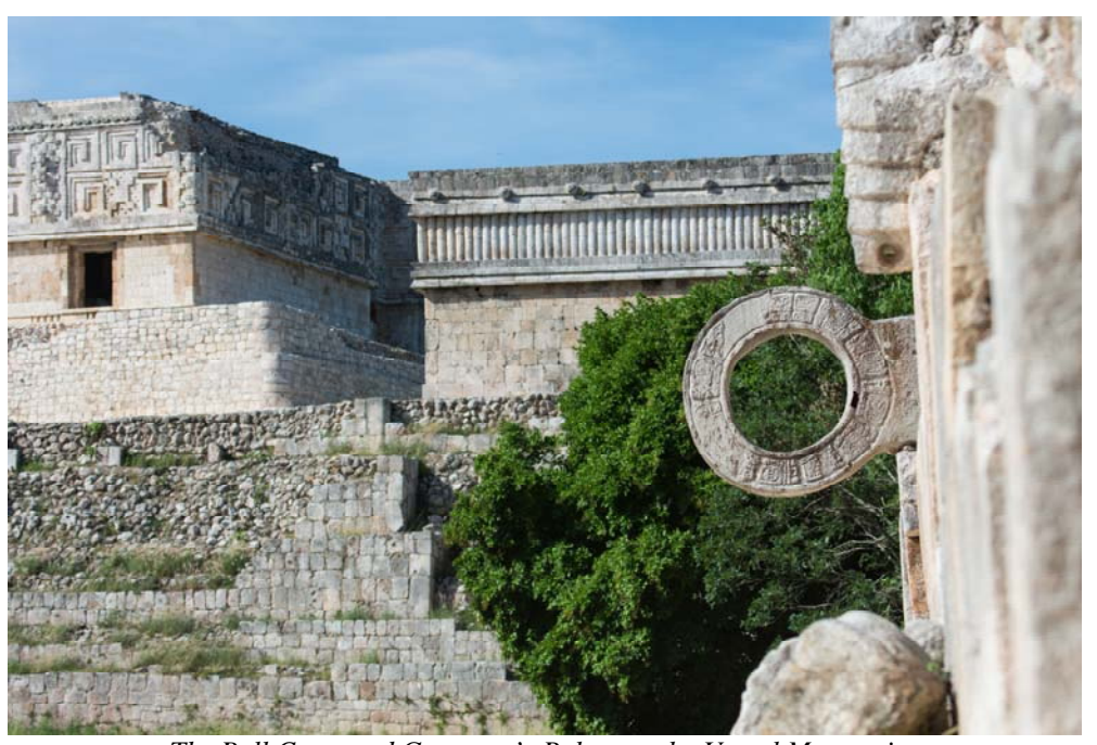
The Ball Court and Governor's Palace at the Uxmal Mayan site