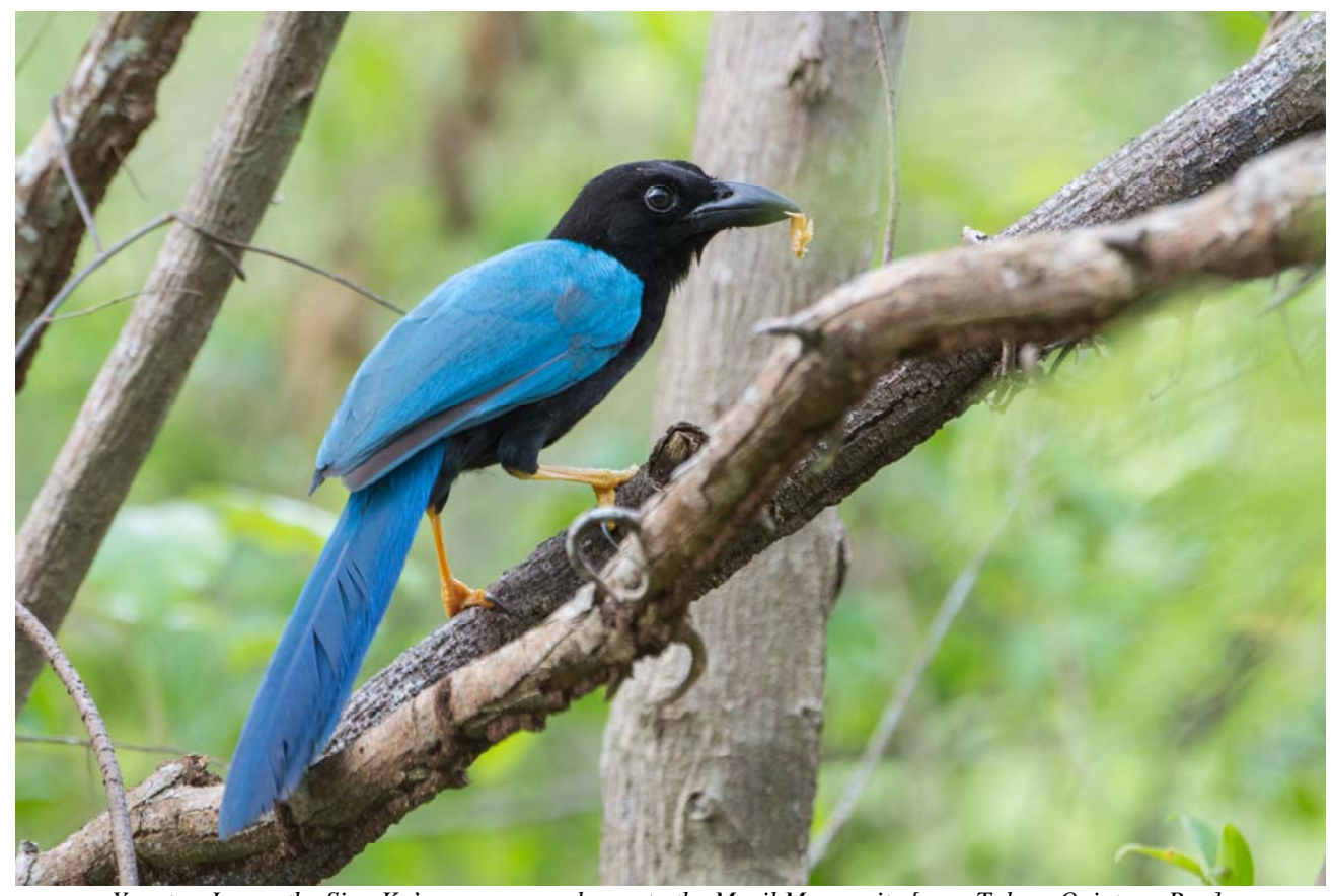
Yucatan Jay on the Sian Ka'an access road near to the Muyil Mayan site [near Tulum, Quintana Roo]