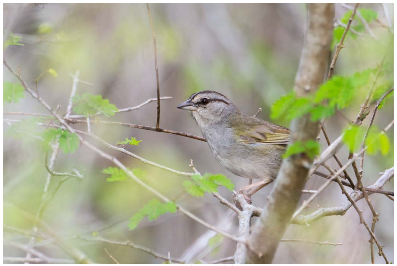
Olive Sparrow [near to the Dzibilchaltún Mayan site]