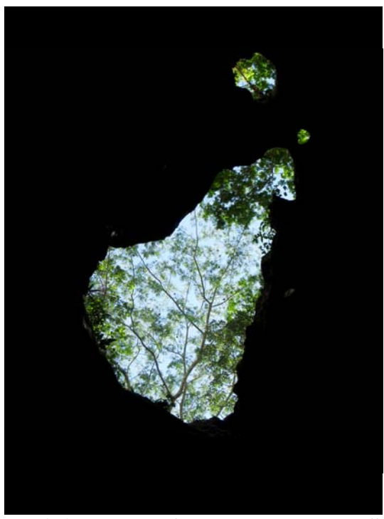
View through the roof of Cenote Samulá [at Dzitnup, near to Valladolid, Yucatan]

This report summarises a four night, self-guided tour of northern and eastern Yucatan peninsula with Emma, criss-crossing back and forth between Quintana Roo and Yucatan States. We covered 1400+ km on the excellent and largely very quiet roads, dined on spectacular regional and international food in Mérida and Tulum, swam in the lovely Caribbean waters at Tulum and in three distinctly different fresh water cenotes, visited five hugely impressive Mayan archaeological sites (also the venues for the majority of my birding), and enjoyed a taster of lowland forests on the northern tip of the Sian Ka'an Biosphere Reserve. A plus of visiting outside the winter high season was the lack of crowds at the Mayan sites (few visitors at Uxmal, Kabáh, and Dzibilchaltún, no one other than the caretaker at Muyil when it opened!) – with the notable exception of Tulum, which was heaving with thousands of visitors by the time we arrived mid-morning.