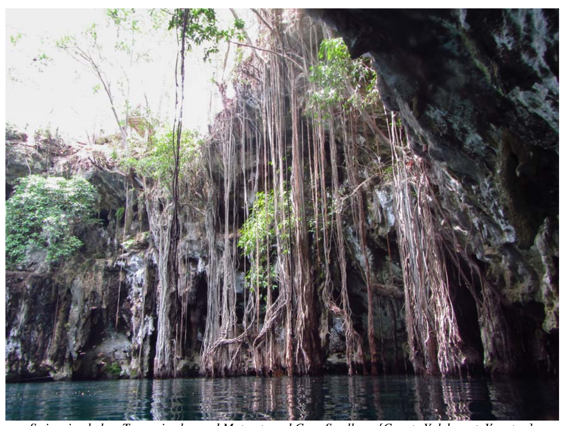
Swimming below Turquoise-browed Motmots and Cave Swallows [Cenote Yokdzonot, Yucatan]