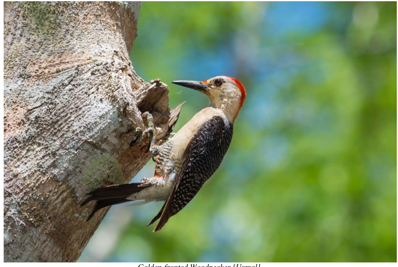
Golden-fronted Woodpecker [Uxmal]