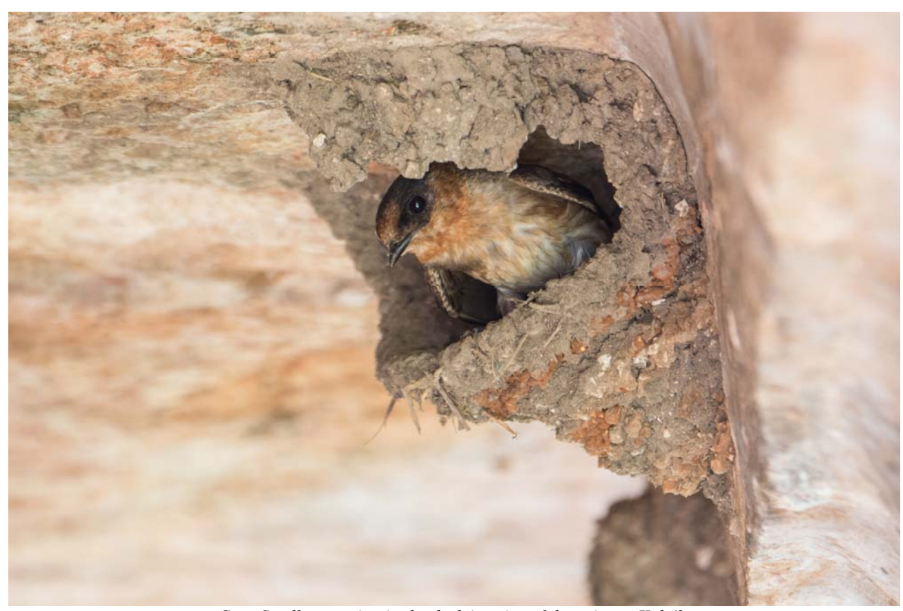
Cave Swallow nesting in the dark interior of the ruins at Kabáh