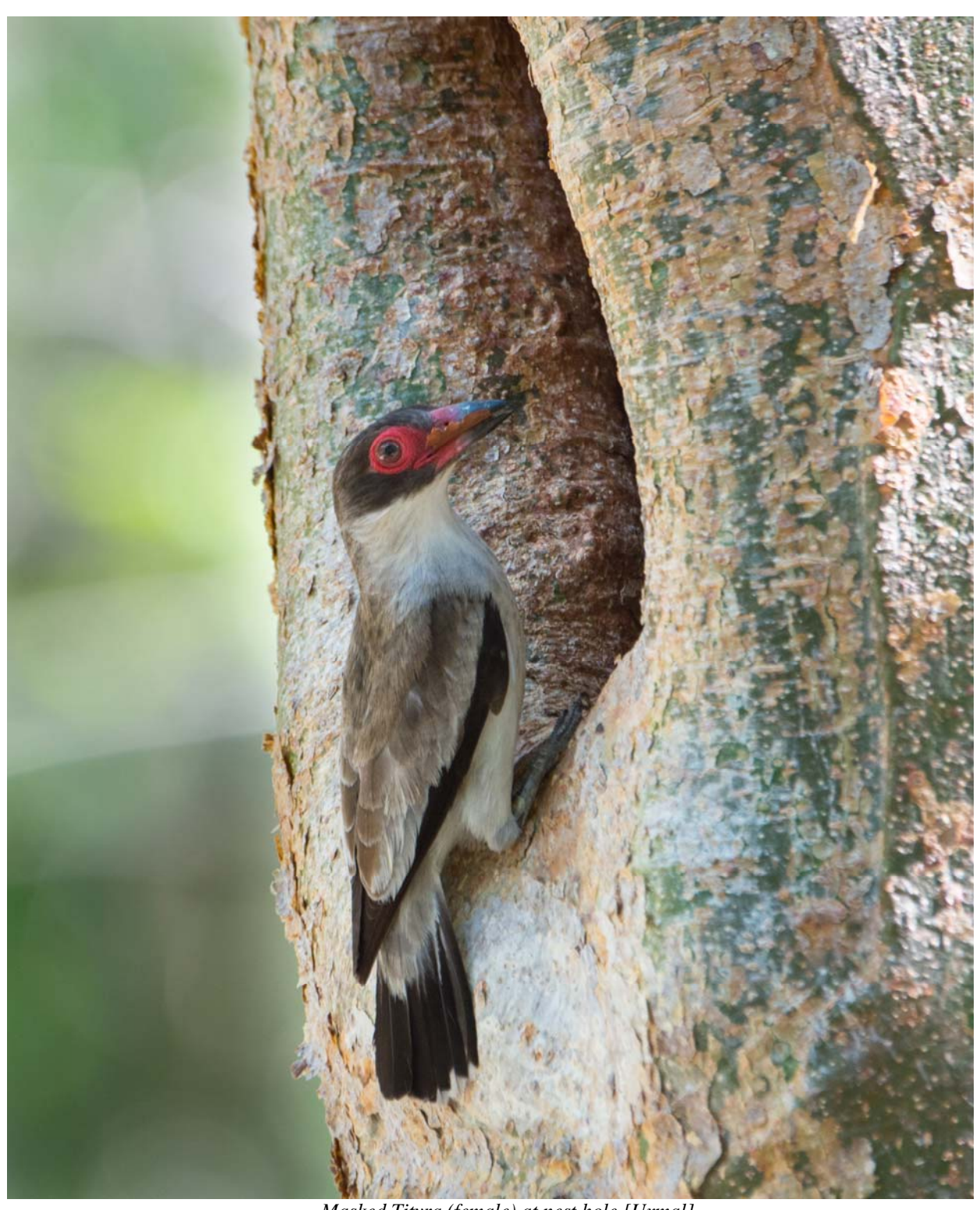
Masked Tityra (female) at nest hole [Uxmal]