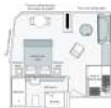
Emerald Riverview Suite