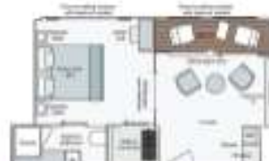
Owner's One-Bedroom Suite