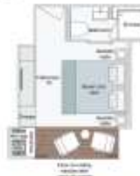
Panorama Balcony Suite