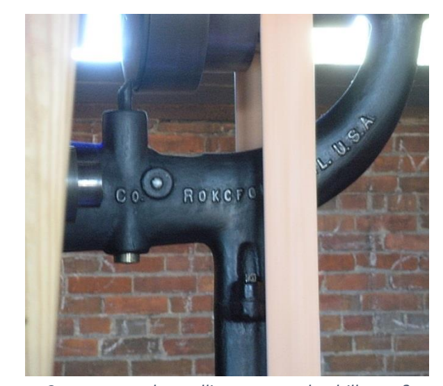
Can you spot the spelling error on the drill press?

A huge thanks to Joe and Bean for putting together this fantastic tour and finding some great back roads to see the countryside. The tour was very well-planned, the route was both enjoyable and educational, and the driving instructions were so professionally done. Plus it was a great opportunity to make some memories with the Model A club.