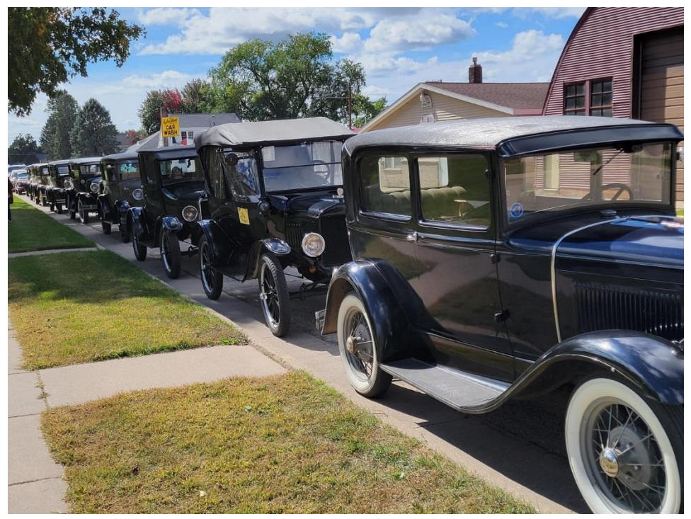
The tour stopped in Cuba City for lunch on Day 1

the park for a picnic lunch. The wind was a bit breezy, but ample sunshine helped to compensate. After lunch we hit the road again crossing into Iowa and making our way into downtown Dubuque. There we took the 4<sup>th</sup> Street Elevator up to get a bird's eye view of the city. From that vantage point you could see across the river into both Illinois and Wisconsin.