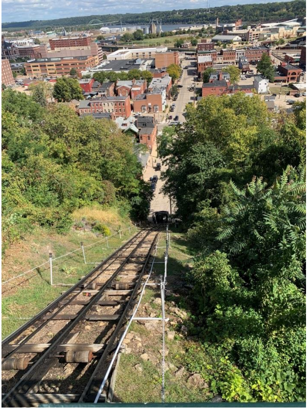
View from the top of the elevator. Iowa is in the foreground, Illinois and Wisconsin are across the river