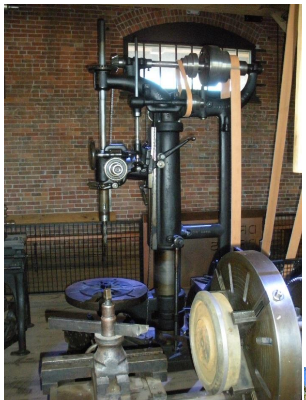
A 1910 drill press made by the Rockford Tool Company

local park. We then continued our eastward trek to the Apple Canyon Lake waterfall. This is truly a hidden gem and made a beautiful backdrop for our second photo op.