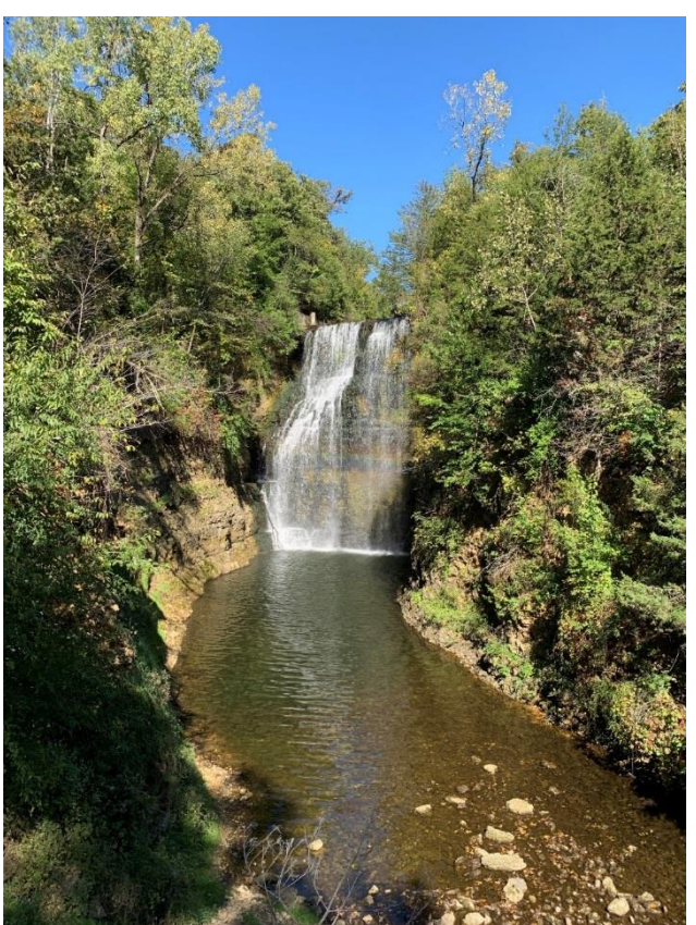
The Apple Canyon Lake Waterfall is off the beaten path, but worth the drive