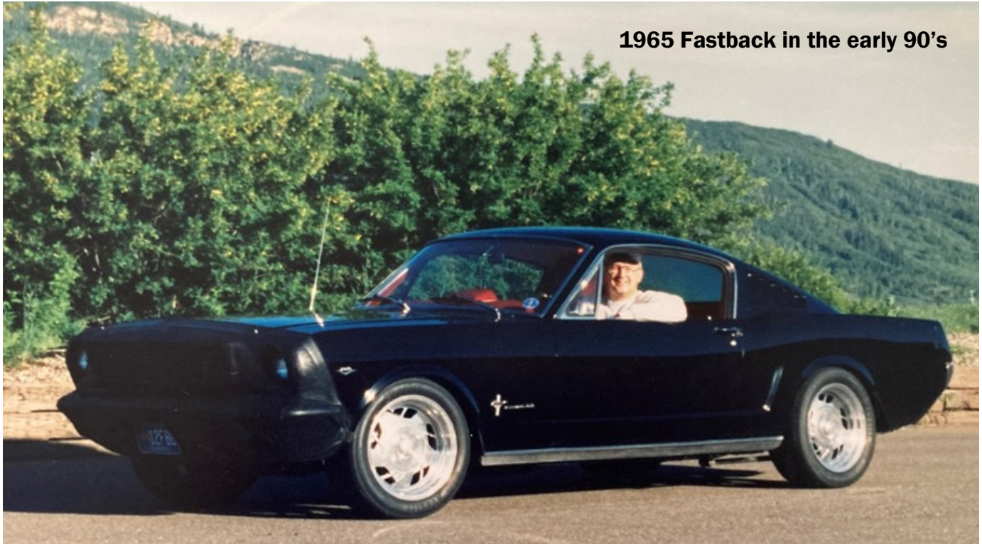
1965 Fastback in the early 90's

This brought about a rethinking on the cars suspension and what would be needed to make it more competitive with Rick's car.