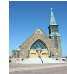
Saint Augustine's 340 Dominion Street Moncton, NB