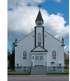
Our Lady of Mercy 11 St. Andrews Street Pointe-du-Chêne, NB