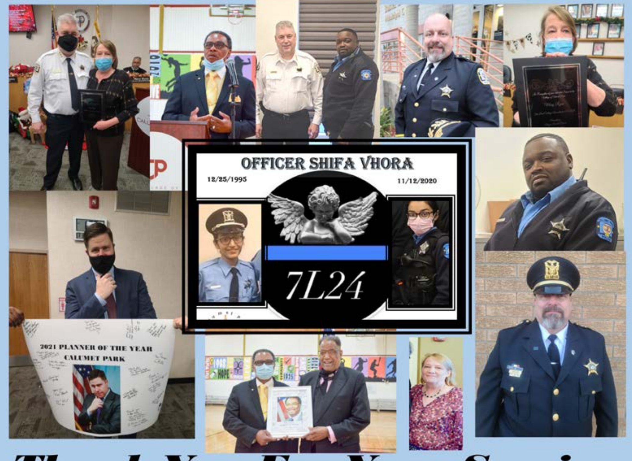
Thank You For Your Service