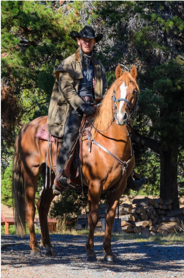
NFF Society King's Opus 2007-HC-133-FH (NFF Wilson's Society King x Rascal's Favorite Lady)

Opie is one of the herd sires at Tsuniah Walkers. He passes on his good disposition, good mind, and gait to his foals. Opie also puts a pretty head on his foals.