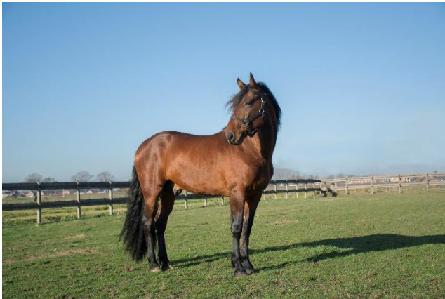
Sniekershofs Allen's Gust