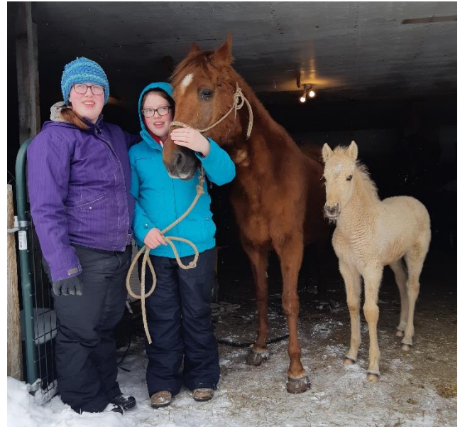
Gem’s January Surprise

Colt sired by Uphill Heir Trigger IHWHA 2002-HC- 343-FH x Walkien Starlite Gem, a full sister to Walkien Jesse Skywalker, IHWHA 2005-HC-177-FH. the palomino colouring comes through Trigger Jr., also a Hunter’s Allen descendant. Long time ago, going back to a horse born in 1906. He has Hunter’s Allen several times on his pedigree and is perhaps the youngest Hunter’s Allen descendant at the time of his birth.