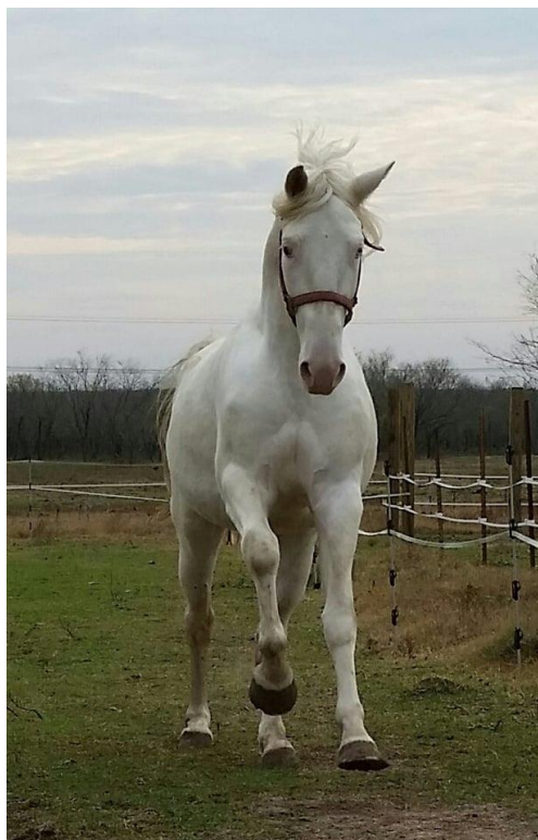
NFF Society's Moonstone

“Stony” was born in Wisconsin and made his way south to Texas to become the herd sire for Texas Legacy Walkers. He was sired by Sun’s Smokey Midnight out of Wilson’s Ruby Roan. To date, Stony has produced five foals, three of which went to Wisconsin.