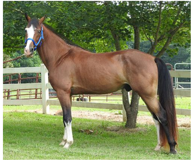
Carbonado Bay At The Moon