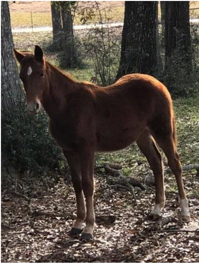
Echo's Johnny Reb