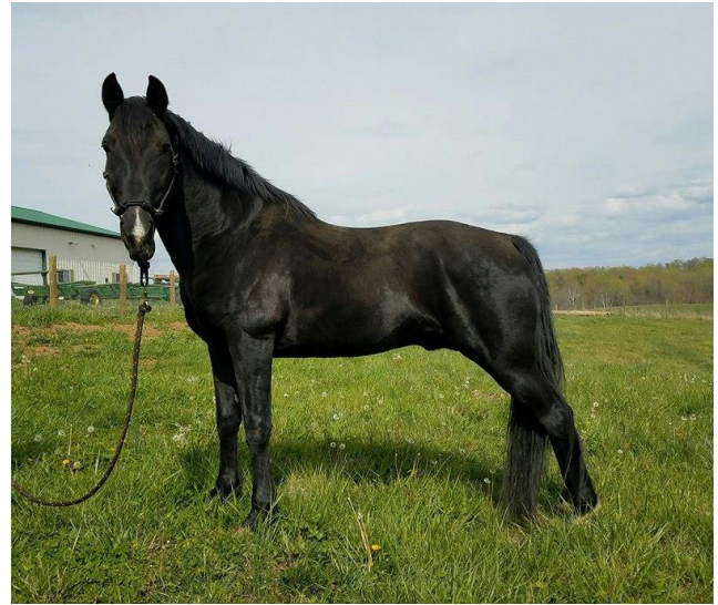
Remembrance's Merry Snip

"Snip" is a gorgeous black stallion, 15.1 hands, 1,000 lbs, foaled in 1996. He is large boned with feet to match and has a ground pounding action very much like his grand sire, Midnight Sun. Snip's sire, Sun's Remembrance (1966-2004) was the last living son of Midnight Sun (1940-1965). Snip's dam, Merry Nite Doll 88, was sired by Merry Boy's F88, one of the last living sons of Merry Boy . Merry Nite Doll's dam, Stormy's Ebony Doll, was sired by Go Boy's Nite Storm, one of the last living sons of Merry Go Boy. Snip has a pedigree that in years past was known as the "royal cross," horses sired by Midnight Sun out of Merry Boy mares. Stormy's Ebony Doll's dam was a direct Ebony Masterpiece daughter and her dam was by the great Society Man. In addition, Snip's registration shows four foundation horses.