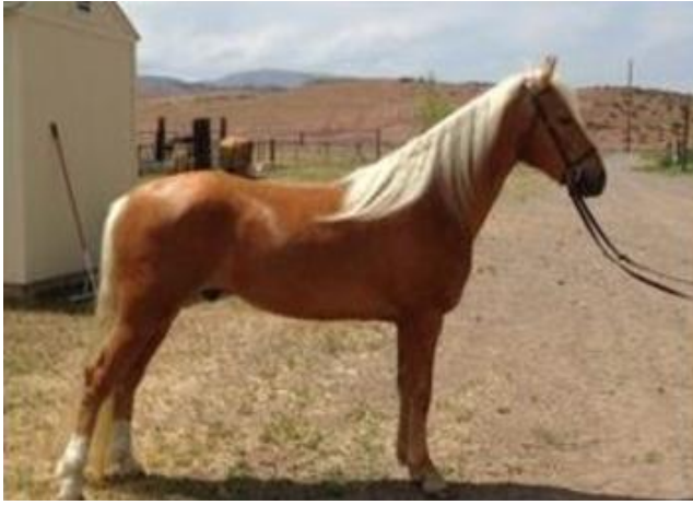
Tsuniah Sage King's Echo