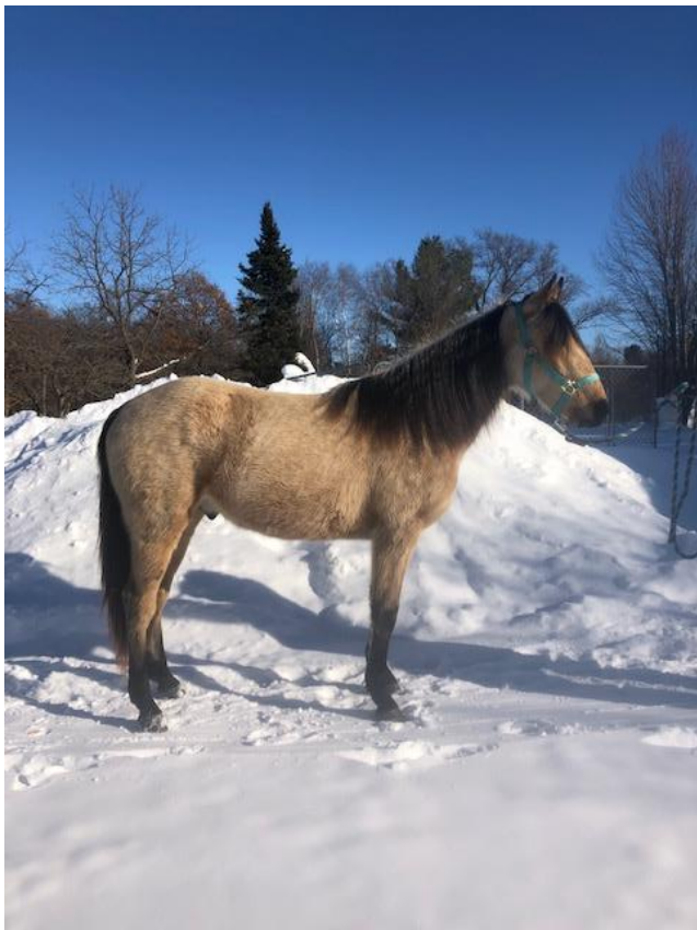
NFF Zebulon’s Golden Sage