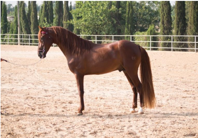
Bud Sterling Beauty (Buds Sterling Bullet x Dement Ballerina Patti)

Jeremiah, aka, J, came to Israel in the fall of 2016. He will be bred to several mares in 2019.