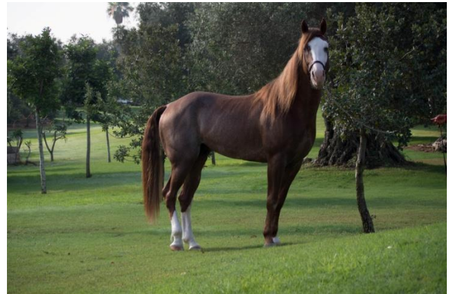
Ostella's Park Taylor IHWHA 2012-HC-190-FH (Society's Lee Allen x Ostella's Diamond Crystal)

One of the stallions on the farm, Bud Sterling Beauty. He is 100% Heritage bloodlines.