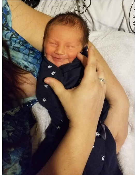
Ryder James Rico