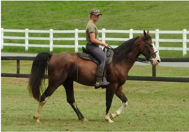
Carbonado Bay At The Moon