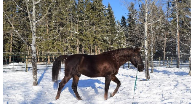
Tsuniah Red Willson's Echo IHWHA 2012-HC-268-FH (Society's Duke Allen x Red Rock Evangelista)

Opie is one of the herd sires at Tsuniah Walkers. He passes on his good disposition, good mind, and gait to his foals. Opie also puts a pretty head on his foals.