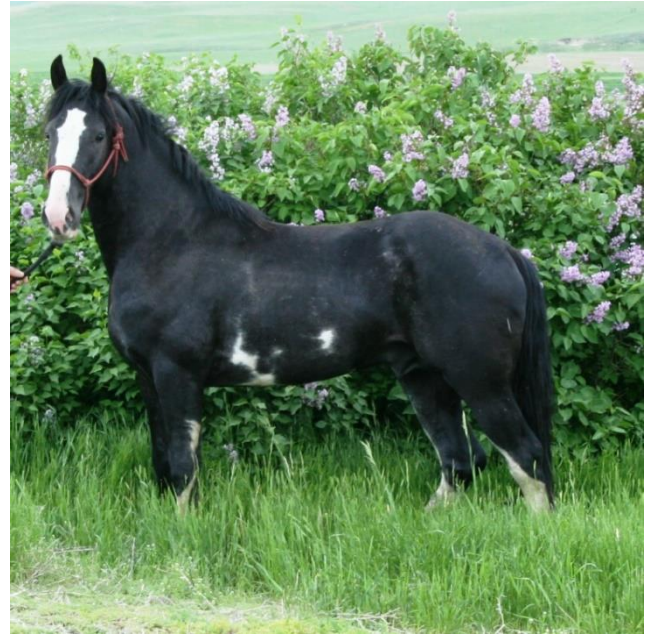
SCW He's A Midnight Legend