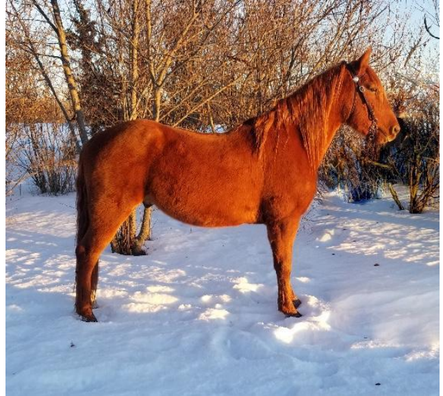
LL Chance’s Red Rascal

Foaled in October of 2014, LL CHANCE’S RED RASCAL is by Darkie’s Last Chance out of Moonlit Laughter by Red Bud’s Rascal. Registered TWHBEA #21401915, CRTWH #2014-3909, & now International Heritage Walking Horse Association #1014-HC-378-FH.