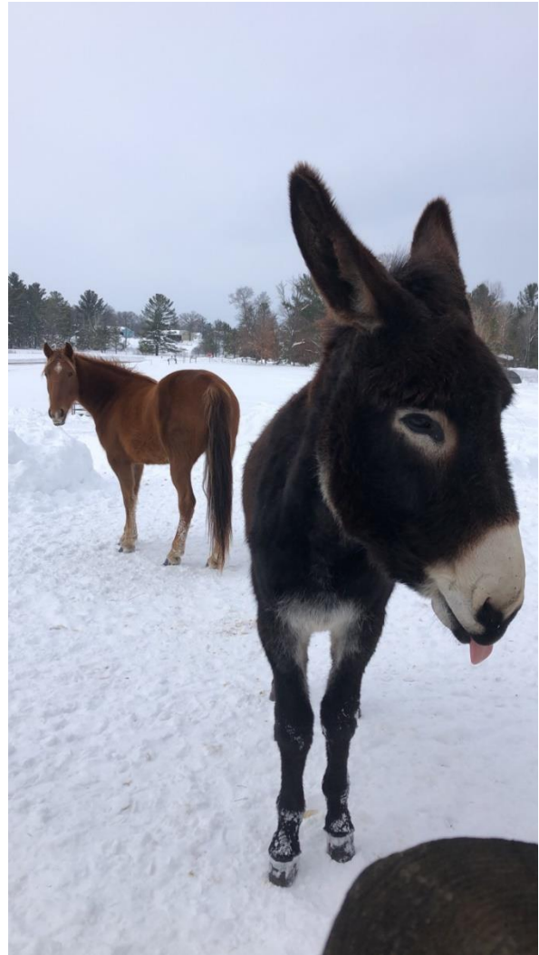
NFF Society’s Soolaimon (background)

(Tsuniah Sages King’s Echo x NFF Wilson’s Lady Scarlet)