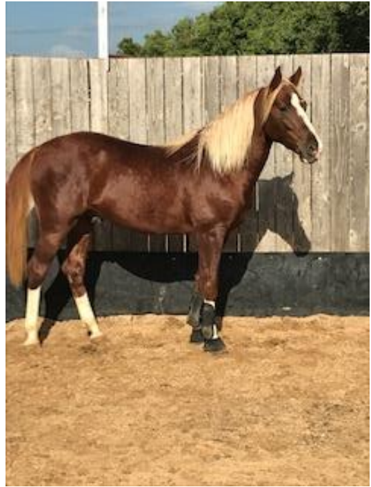
Society's Jeremiah Wilson IHWHA 2016-HC-285-FH (Society's Duke Allen x Carbonado's Nancy Bee)

Thunder came to Israel from Tennessee in 2017. He is very good to ride and trail rides well with other horses.