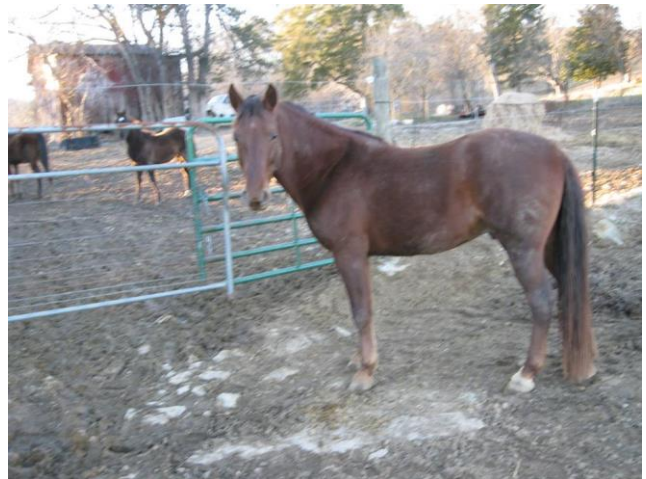
Gen Jeb Stuart CSA