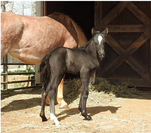
Filly by Carbonado Bay At The Moon out of MHF Society Spice