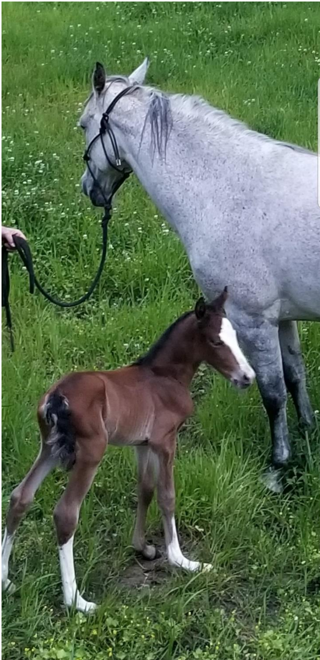
Filly born April 5, sired by Echo's Traveler x Ostella's Southern Diamond. Diamond was sired by Red Bud's Rambling Slim and out of Mr. Leon's Ostella's Diamond Crystal who is now in Israel. This filly is the first Heritage Horse born in Louisiana!!!!