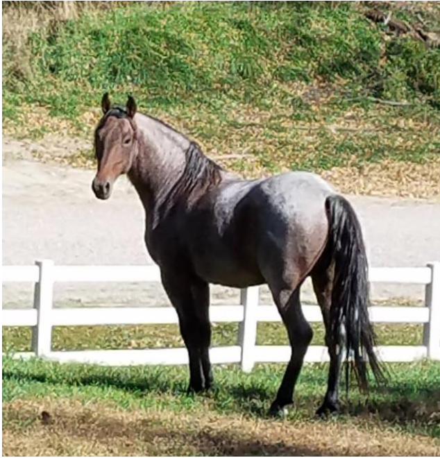
Ostella's Bud Roan Rascal

Sired by Red Bud's Rambling Slim, out of Ostella's Rockann, born in 2013. He is a gentle horse and is TWHBEA registered. He is eligible to be IHWHA registered as Level 1. He is broke to ride but has had limited riding, no bad behavior. His foals are gentle and well gaited. Rascal is being offered for sale, priced at $4,000.