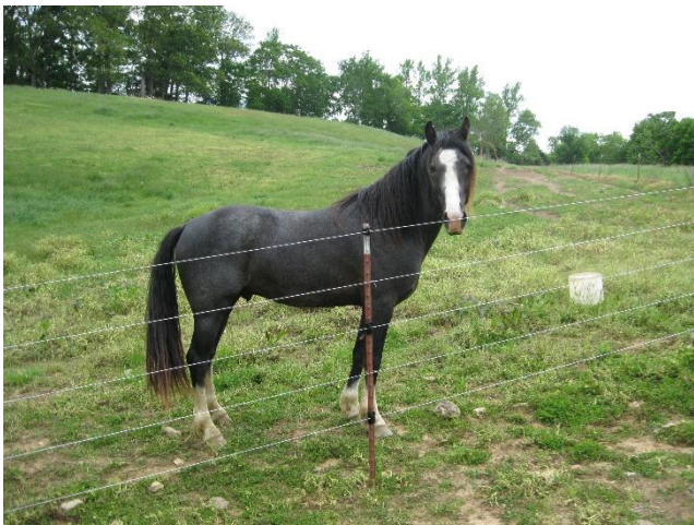
Echo's Confederate Rebel