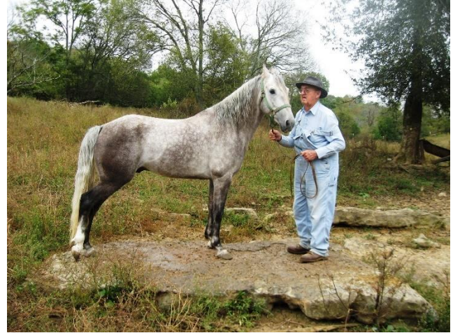
Ostellas Bullet Trademark

owner's voice commands. He is no longer ridden, but loves attention from people, and will stand happily while they pat or scratch or just discuss his merits.