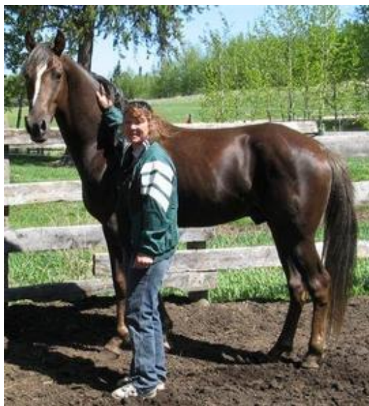
Walkien Jesse Skywalker CRTWH, IHWHA & TWHBEA registered

I absolutely love this horse! He is drop dead gorgeous and a nice moving horse. It is with a heavy heart that I am putting him up for sale. Jesse came here in the fall of 2016. He has sired several foals for me so far. His first US born foals arrived in 2018: Scarlet Star Wilson had a big black colt, NFF PR Dwayne Johnson, who is sold. NFF Angel's Lucky Star had a stocky built black filly, NFF Skywalker's Leia, who is headed to Texas this year. Wilson's Ruby Roan had a lovely chestnut filly, NFF Skywalker's Fermina who is currently for sale.