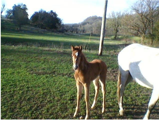
Colt by Red Bud's Rambling Slim out of Ostella's Rockann

Introducing the newest member of the IHWHA family: