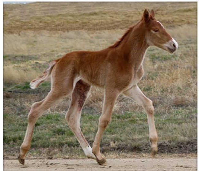
Here he is SCW I'm The Chauffeur by Cruise With The Limo and out of Kodiak's Miss Reflect C.F. . Missy was bred only one day and ultra-sounded 15 days later so we know her exact date of conception and her exact due date. She was due on April 28 but this boy came on April 8, three weeks early.