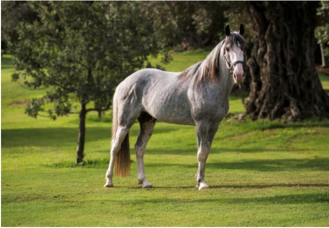
Thunder of Smokey IHWHA 2009-HC-275-FH (Sun's Smokey Midnight x Society's Miss Dolly)

Thunder came to Israel from Tennessee in 2017. He is very good to ride and trail rides well with other horses.