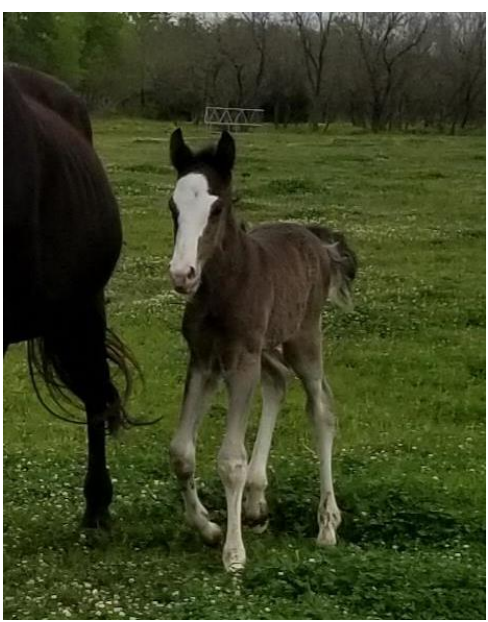
Colt sired by NFF Society's Moonstone out of Miss Gossip, born April 7. He will be for sale!