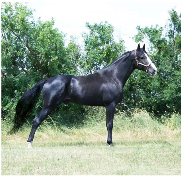
SCW Counting Cadence

SCW Counting Cadence is registered 100% Heritage IHWHA 2007-HC-100, CRTWH #3740, TWHBEA #20700732. Cadence is a 2007 model, black sabino stallion by Slush Creeks Jubal S and out of Dakota Miss Eagle. Cadence is 15.3 hands and has excellent bone and muscle along with an exquisite head. He also has an exceptional, natural, running walk. Cadence inherited his wonderful, calm, gentle, sweet, people-loving personality from his sire. SCW Counting Cadence has 3 lines, including an unbroken top line, to the 14 time World Champion, Hills Perfection. (Hills Perfections registered name was Reyclif Mid-Merry and that was not changed; he was only campaigned as Hills Perfection). Sun's Merry Man, the only offspring by Hills Perfection to reproduce, was owned by and stood at the famed Double Diamond Ranch for many years. Cadence's dam, Dakota Miss Eagle was one of eight original mares that came to Slush Creek Walkers from the late Calvin Millers breeding program of the Double Diamond Ranch. Eagle produced several outstanding foals for us during her broodmare career and Cadence is truly one of the very best!