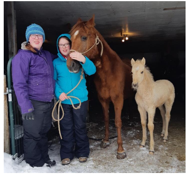
Gem's January Surprise

Colt sired by Uphill Heir Trigger IHWHA 2002-HC- 343-FH x Walkien Starlite Gem, a full sister to Walkien Jesse Skywalker, IHWHA 2005-HC-177-FH. the palomino colouring comes through Trigger Jr., also a Hunter's Allen descendant. Long time ago, going back to a horse born in 1906. He has Hunter's Allen several times on his pedigree and is perhaps the youngest Hunter's Allen descendant at the time of his birth.