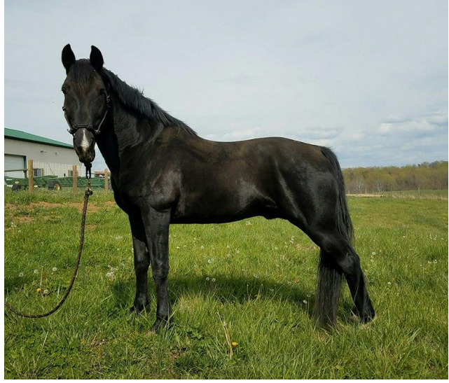
Remembrance's Merry Snip

"Snip" is a gorgeous black stallion, 15.1 hands, 1,000 lbs, foaled in 1996. He is large boned with feet to match and has a ground pounding action very much like his grand sire, Midnight Sun. Snip's sire, Sun's Remembrance (1966-2004) was the last living son of Midnight Sun (1940-1965). Snip's dam, Merry Nite Doll 88, was sired by Merry Boy's F88, one of the last living sons of Merry Boy . Merry Nite Doll's dam, Stormy's Ebony Doll, was sired by Go Boy's Nite Storm, one of the last living sons of Merry Go Boy. Snip has a pedigree that in years past was known as the "royal cross," horses sired by Midnight Sun out of Merry Boy mares. Stormy's Ebony Doll's dam was a direct Ebony Masterpiece daughter and her dam was by the great Society Man. In addition, Snip's registration shows four foundation horses.