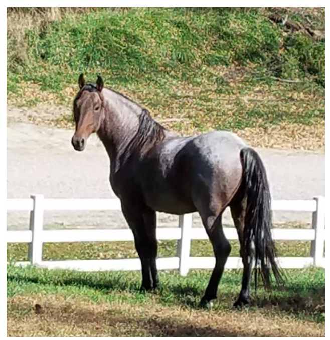
Ostella's Bud Roan Rascal

Sired by Red Bud's Rambling Slim, out of Ostella's Rockann, born in 2013. He is a gentle horse and is TWHBEA registered. He is eligible to be IHWHA registered as Level 1. He is broke to ride but has had limited riding, no bad behavior. His foals are gentle and well gaited. Rascal is being offered for sale, priced at $4,000.