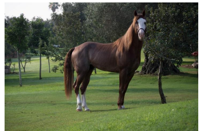
Ostella's Park Taylor IHWHA 2012-HC-190-FH (Society's Lee Allen x Ostella's Diamond Crystal)

One of the stallions on the farm, Bud Sterling Beauty. He is 100% Heritage bloodlines.