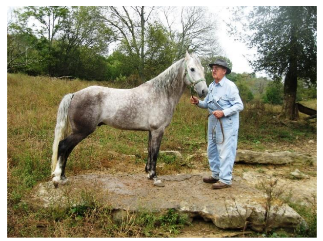
Ostellas Bullet Trademark

owner's voice commands. He is no longer ridden, but loves attention from people, and will stand happily while they pat or scratch or just discuss his merits.