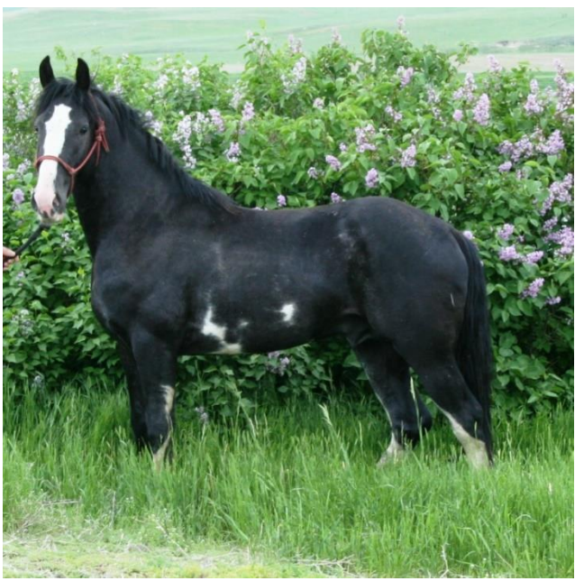
SCW He's A Midnight Legend