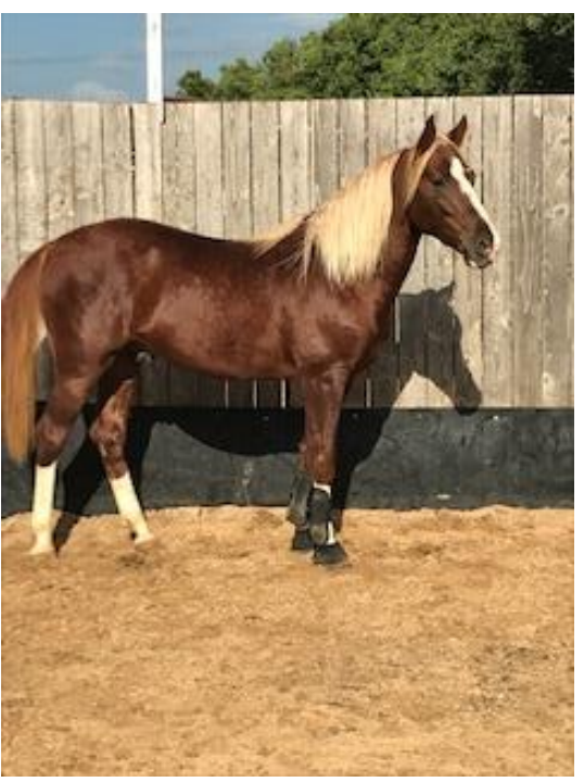
Society's Jeremiah Wilson IHWHA 2016-HC-285-FH (Society's Duke Allen x Carbonado's Nancy Bee)

Thunder came to Israel from Tennessee in 2017. He is very good to ride and trail rides well with other horses.