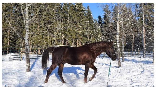
Tsuniah Red Wilsson's Echo IHWHA 2012-HC-268-FH (Society's Duke Allen x Red Rock Evangelista)

Opie is one of the herd sires at Tsuniah Walkers. He passes on his good disposition, good mind, and gait to his foals. Opie also puts a pretty head on his foals.