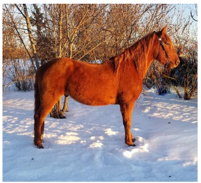
LL Chance's Red Rascal

Check out the Sales Barn for the palomino foal sired by Smokey!!!!