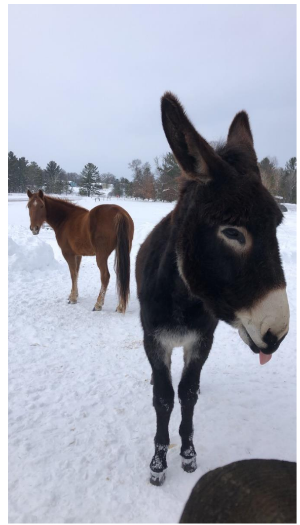
NFF Society's Soolaimon (background)

(Tsuniah Sages King's Echo x NFF Wilson's Lady Scarlet)