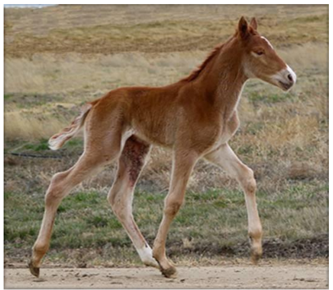
Here he is SCW I'm The Chauffeur by Cruise With The Limo and out of Kodiak's Miss Reflect C.F. . Missy was bred only one day and ultrasounded 15 days later so we know her exact date of conception and her exact due date. She was due on April 28 but this boy came on April 8, three weeks early.