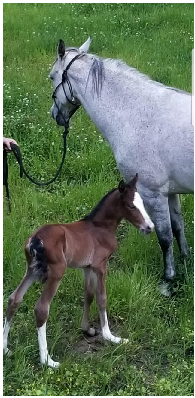
Filly born April 5, sired by Echo's Traveler x Ostella's Southern Diamond. Diamond was sired by Red Bud's Rambling Slim and out of Mr. Leon's Ostella's Diamond Crystal who is now in Israel. This filly is the first Heritage Horse born in Louisiana!!!!