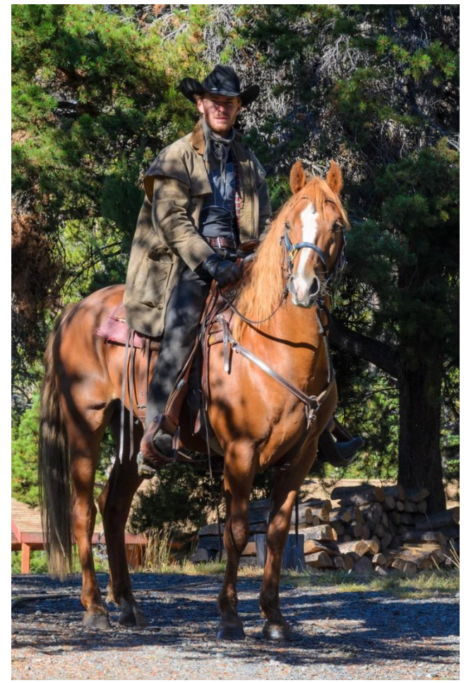
NFF Society King's Opus 2007-HC-133-FH (NFF Wilson's Society King x Rascal's Favorite Lady)

Opie is one of the herd sires at Tsuniah Walkers. He passes on his good disposition, good mind, and gait to his foals. Opie also puts a pretty head on his foals.