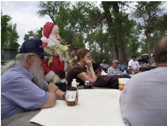
Will the real Rendez-Claus please stand up?