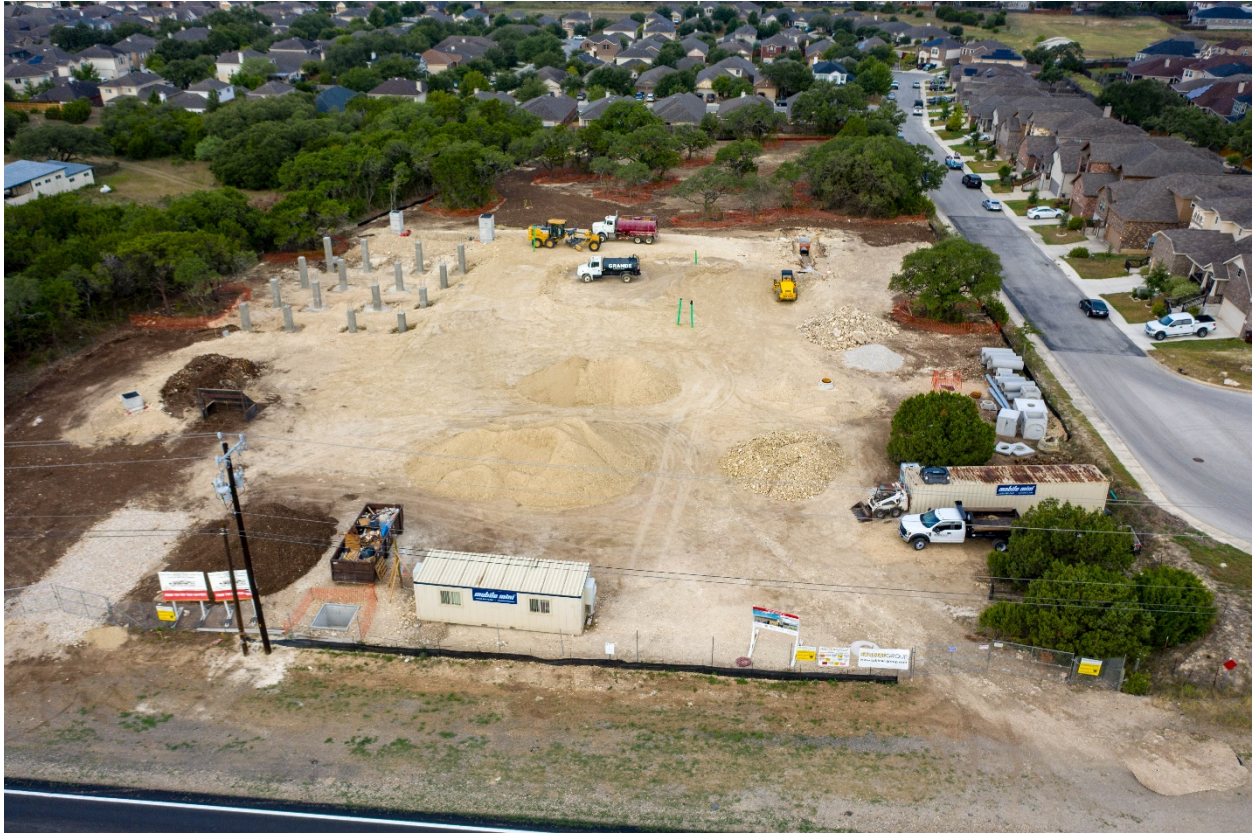
EXHIBIT 14 – CURRENT SITE PICTURE 08.29.20

Approve and pay the following Invoices for August, 2020: