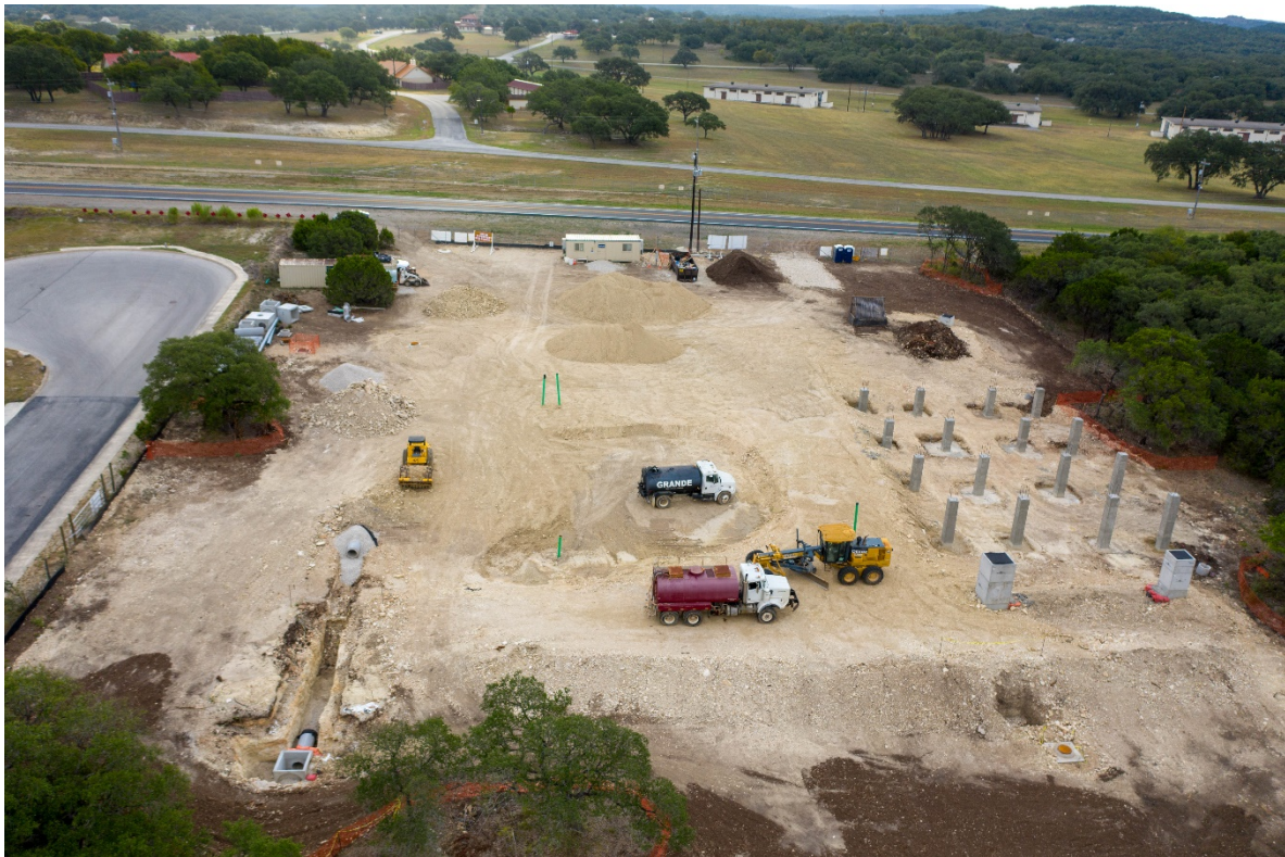
EXHIBIT 10 – AERIAL SITE VIEW 08.29.20