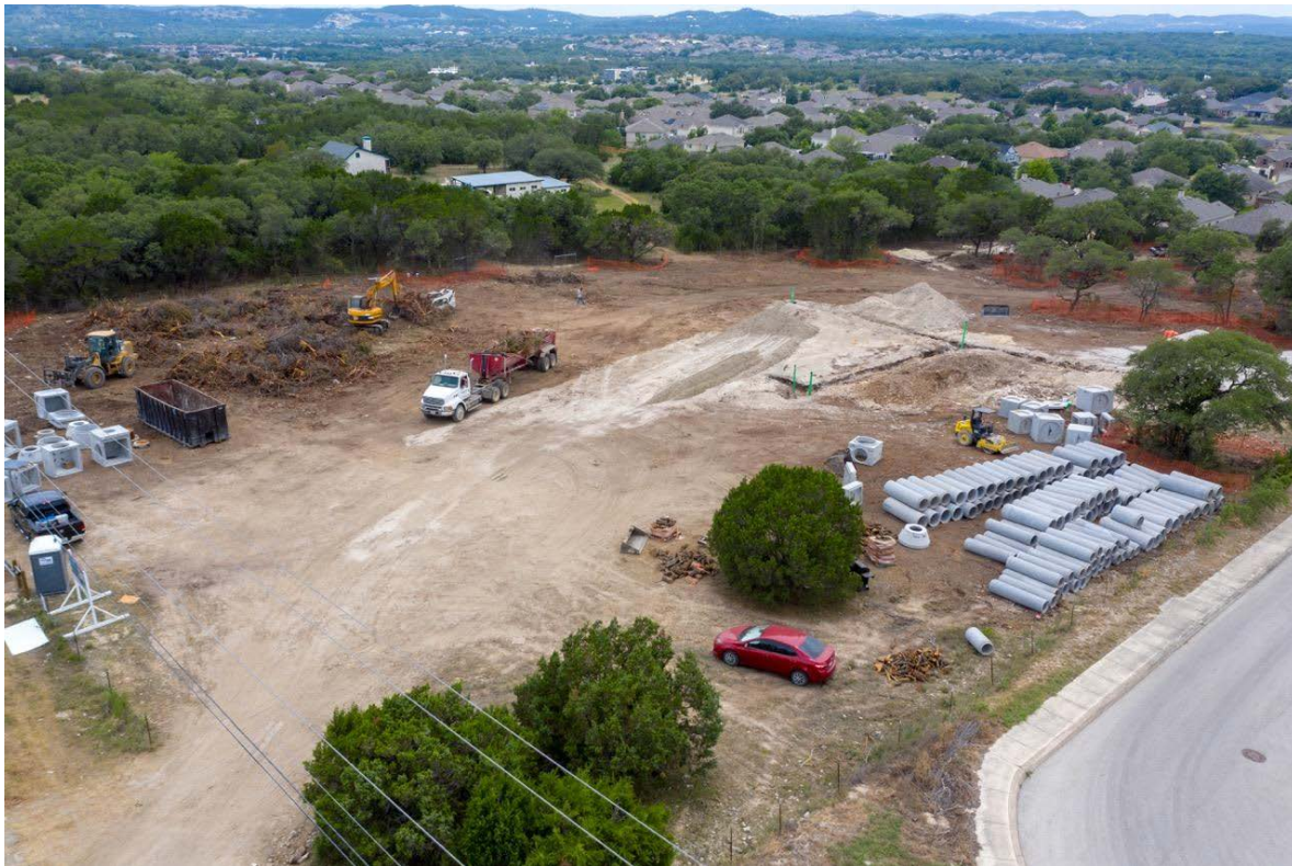
EXHIBIT 13 – 2 MONTH OLD SITE PICTURE 06.23.20