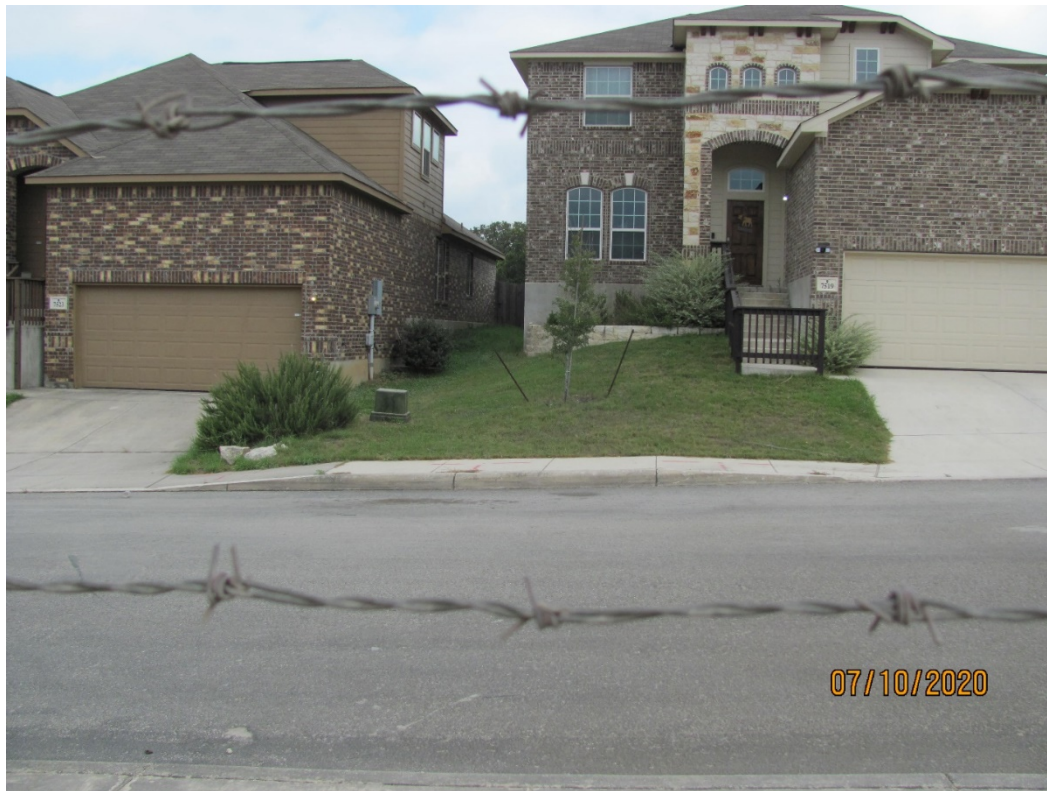
EXHIBIT 1 – PRESIDIO HAVEN – OFF SITE UTILITIES 07.10.20