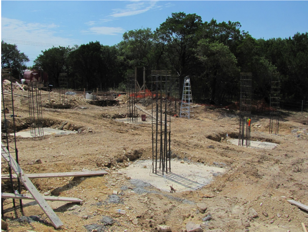
EXHIBIT 3 – APP. BAY SUPPORT COLUMNS / REBAR “CAGES” 08.04.20