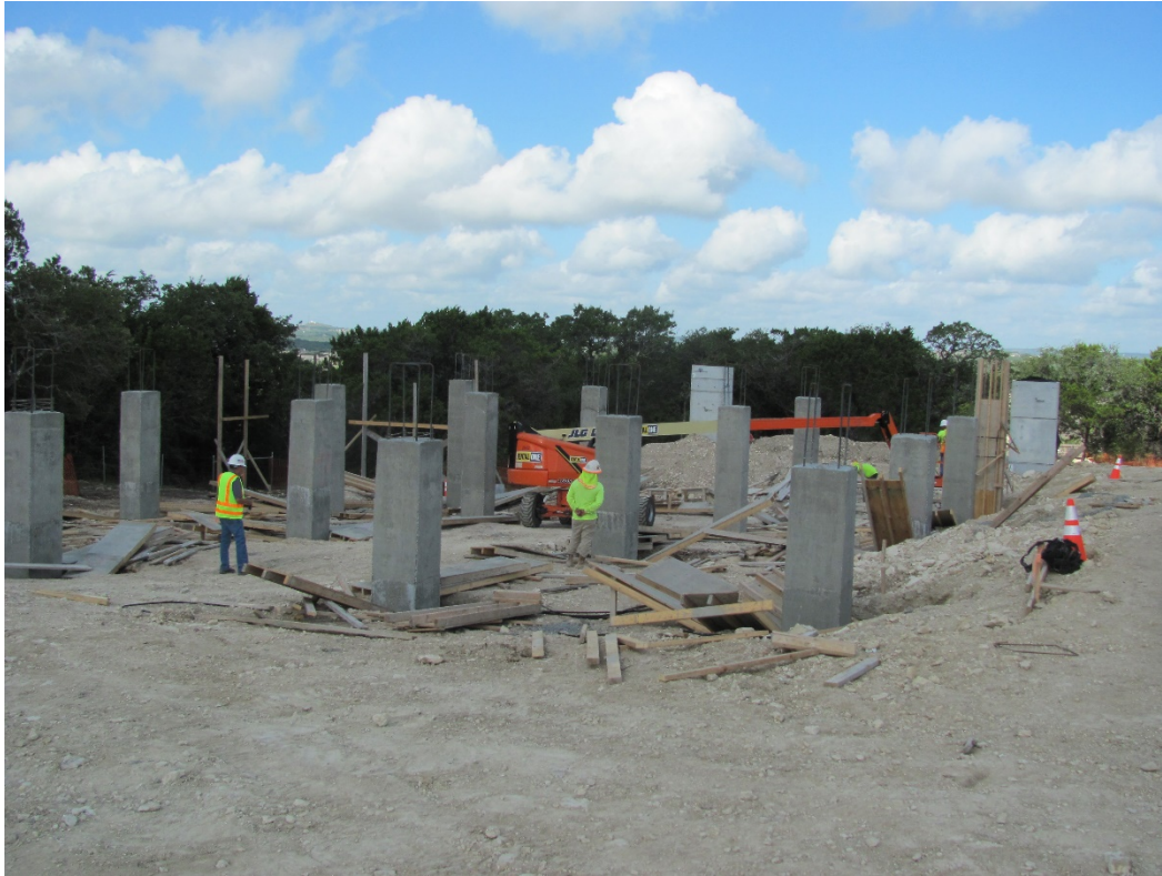
EXHIBIT 7 – POURED COLUMNS FOR APP. BAY BEAM SUPPORTS 08.10.20