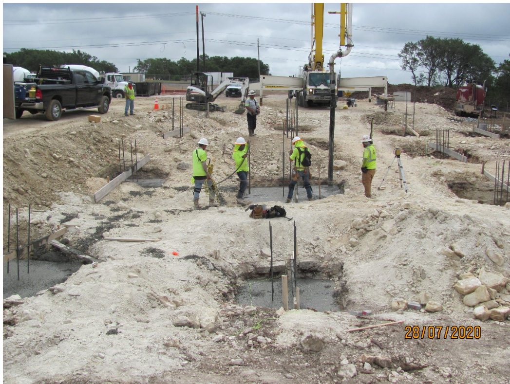
EXHIBIT 2 – CONCRETE POUR FOR APP. BAY SPREAD FOOTINGS 07.28.20