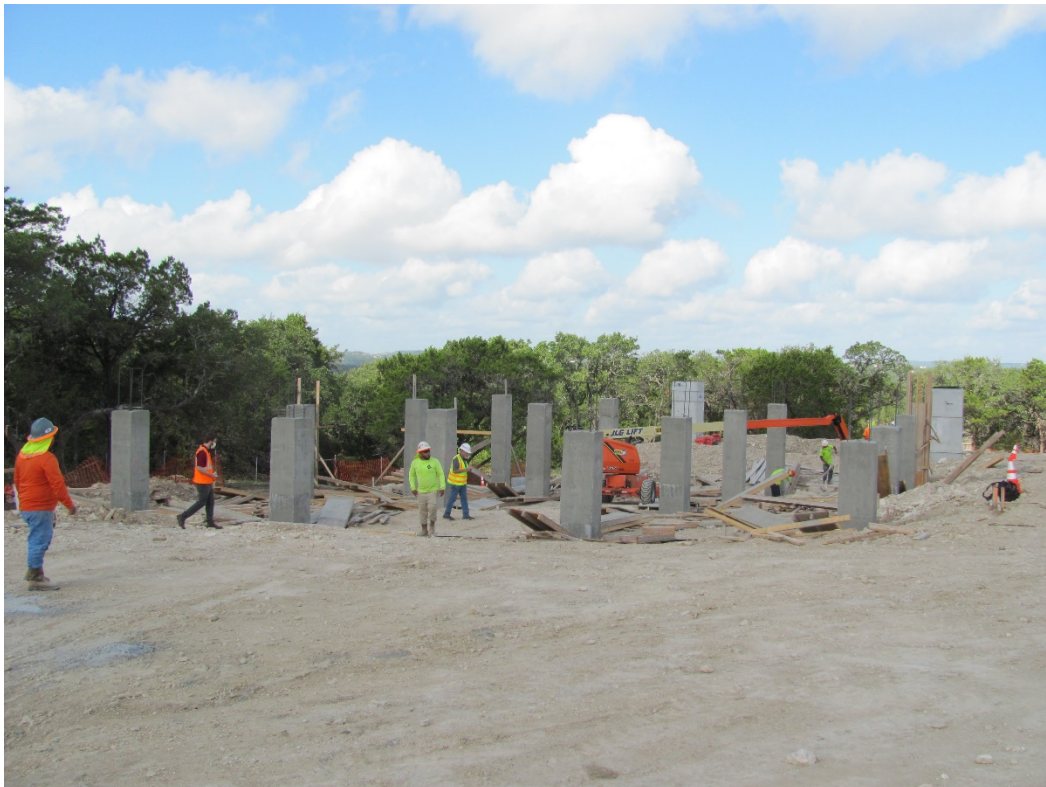
EXHIBIT 8 – POURED COLUMNS FOR APP. BAY BEAM SUPPORTS 08.10.20