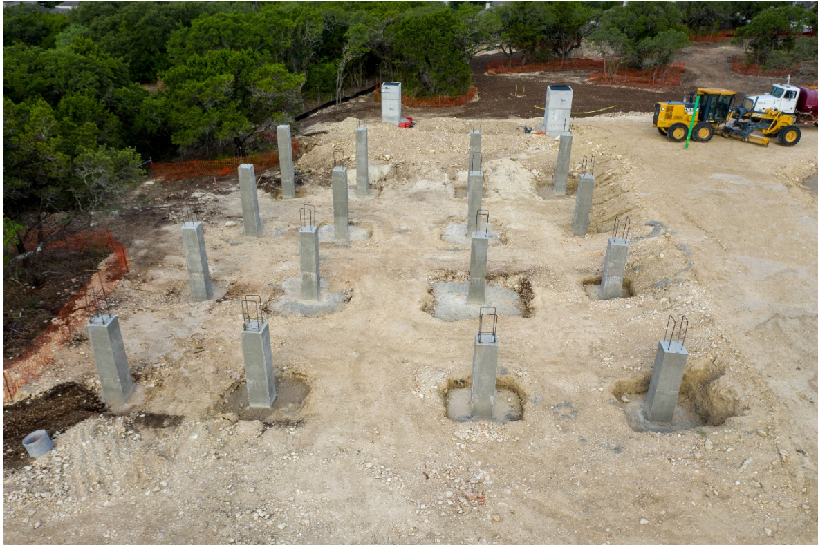
EXHIBIT 9 – COLUMNS FOR APP. BAY BEAM SUPPORTS 08.29.20