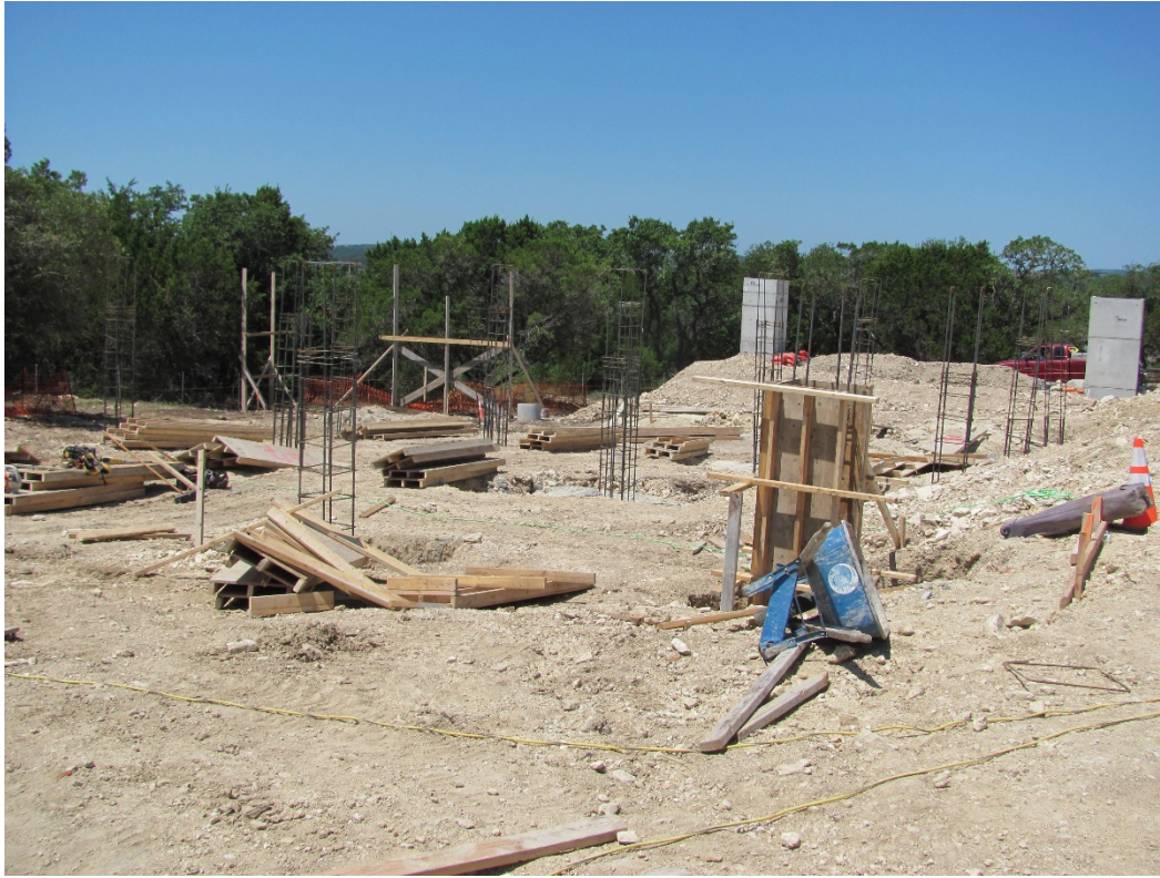
EXHIBIT 5 – APP. BAY COLUMN FORMS BEING ERECTED 08.05.20