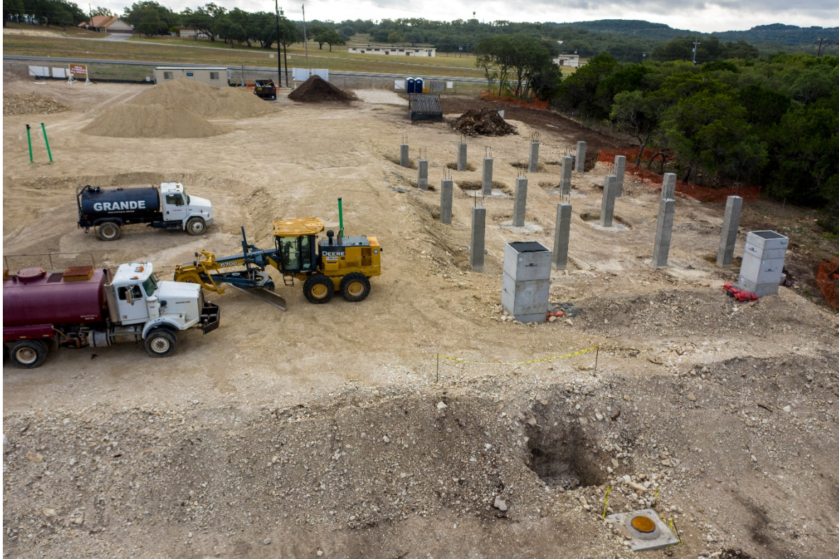
EXHIBIT 11 – AERIAL SITE VIEW 08.29.20