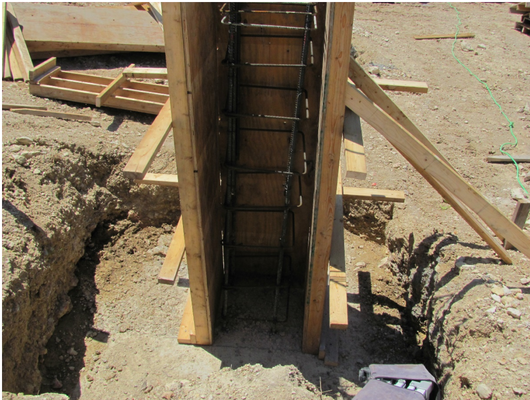
EXHIBIT 6 – APP. BAY COLUMN FORMED; OPEN FOR INSPECTION 08.05.20