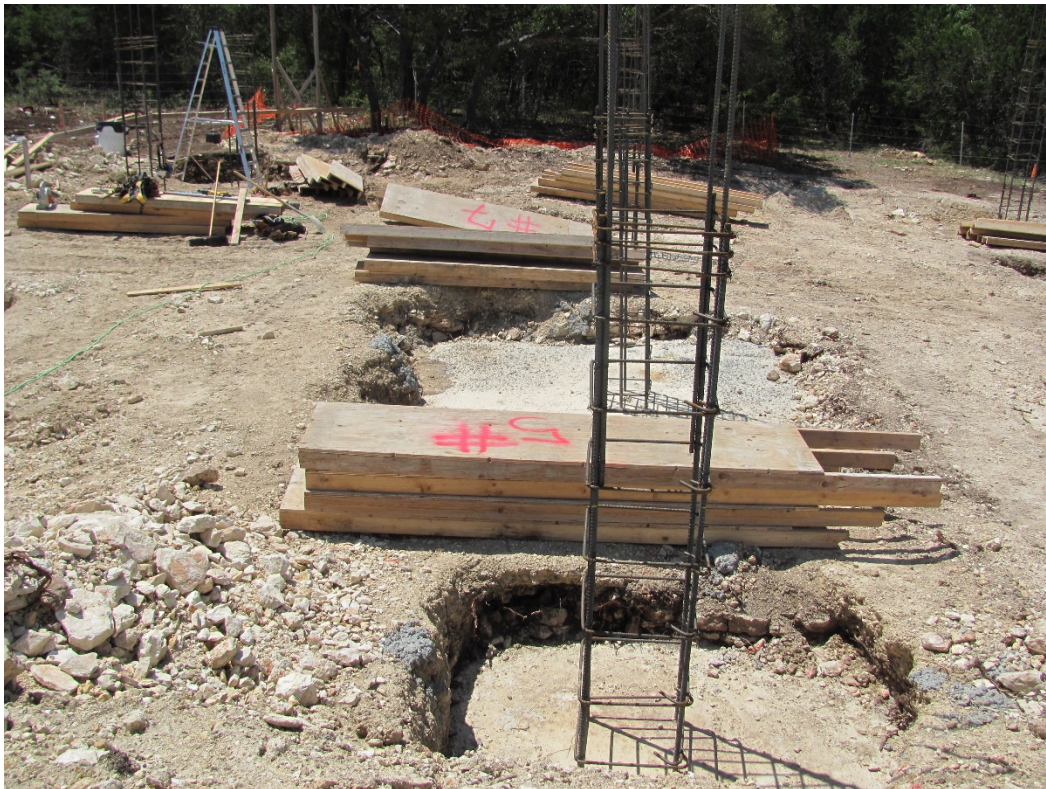
EXHIBIT 4 – FORMS TO BE ERECTED BY COLUMN 08.05.20