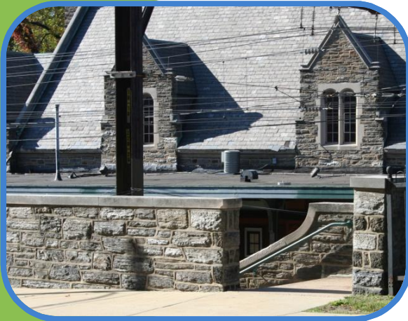
Bridge Aesthetic Treatment