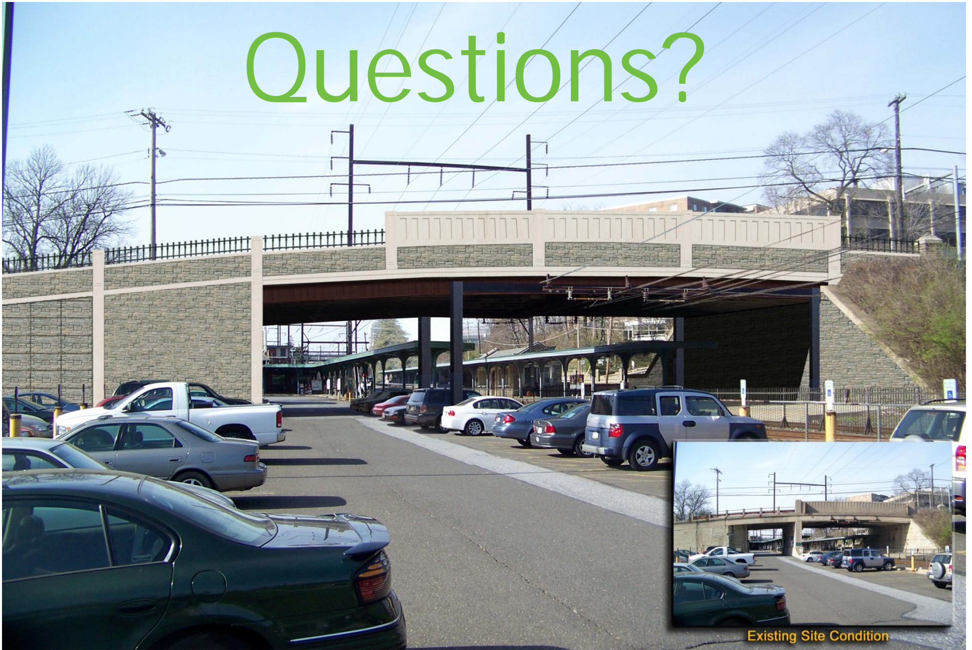
Existing Site Condition