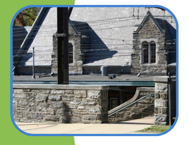
Bridge Aesthetic Treatment