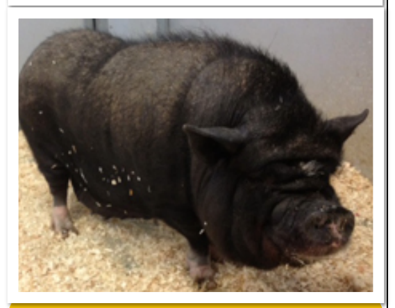
What's that? Why yes, as a matter of fact, these ARE pictures of real pigs in need of new homes, whom you can meet on the <u>CPPA web site</u>. Faces like these are why CPPA exists, and seeing them in loving homes is what makes it all worthwhile.