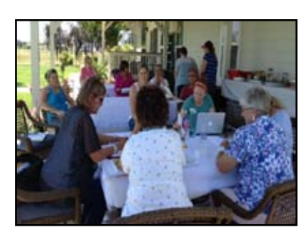
May General Meeting