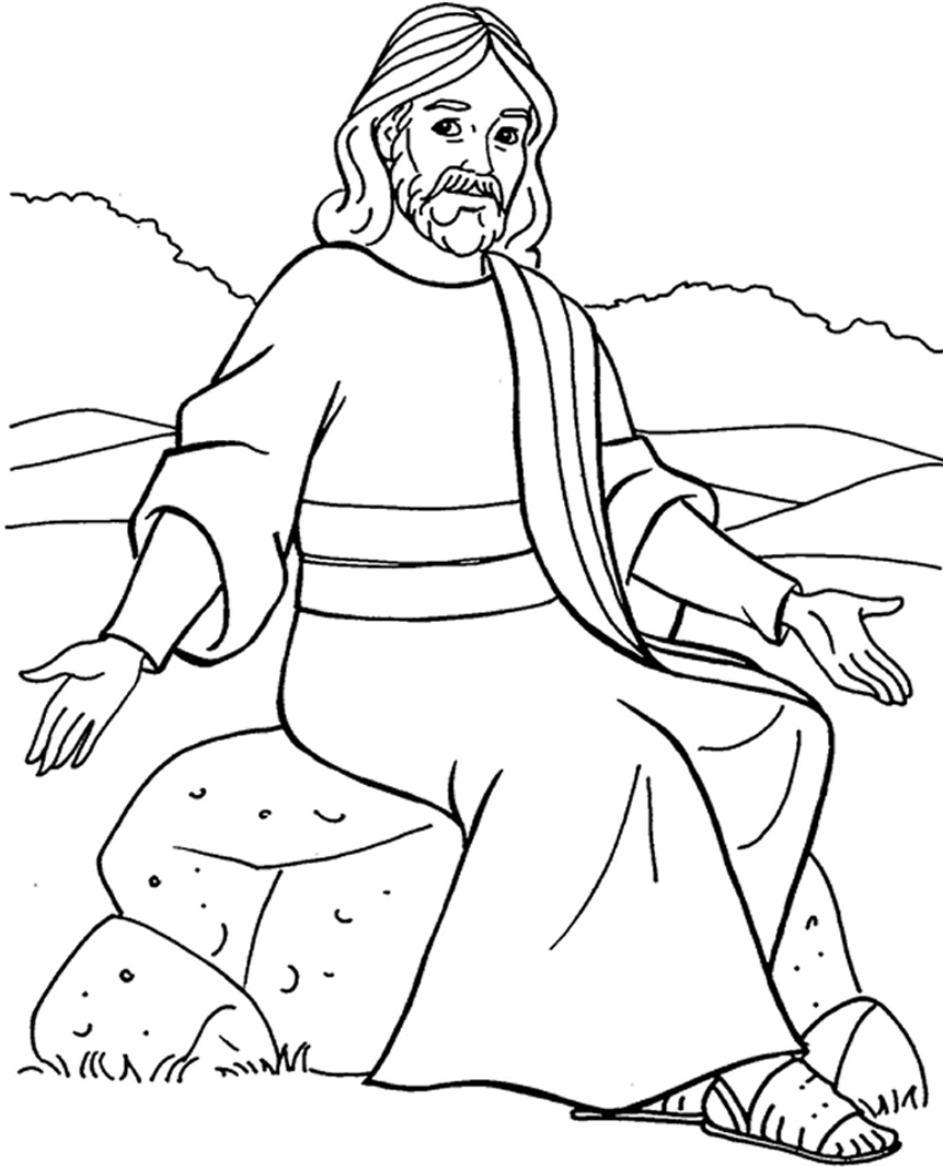
The Parable of the Weeds

Copyright © CalvaryCurriculum.com Used by Permission