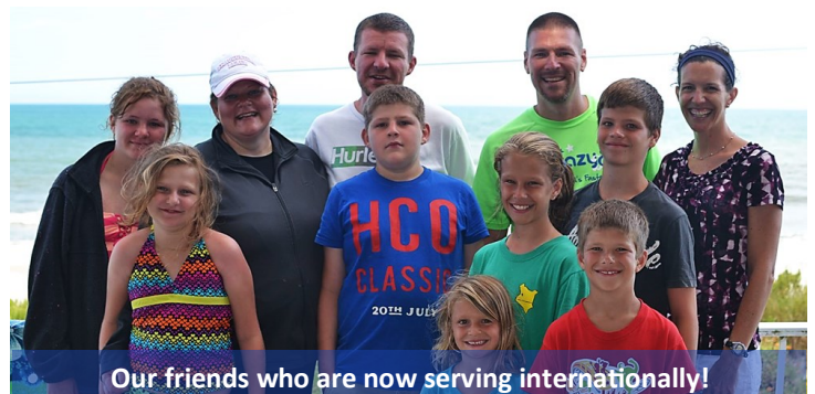
Our friends who are now serving internationally!

The summer months are extremely busy for our family. Early mornings and late nights are our daily schedule from the beginning of June until mid-August. This summer, we were able to claim some special time with the family throughout the summer craziness. Our kids love meeting the new teams each week. Some weeks are reconnecting with friends from previous times, and other weeks the kids are making new friends.