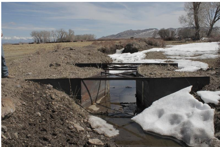
Flume looking downstream