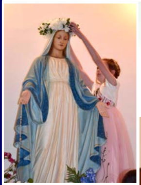
2<sup>nd</sup> graders wore their First Communion outfits to May Crowning.