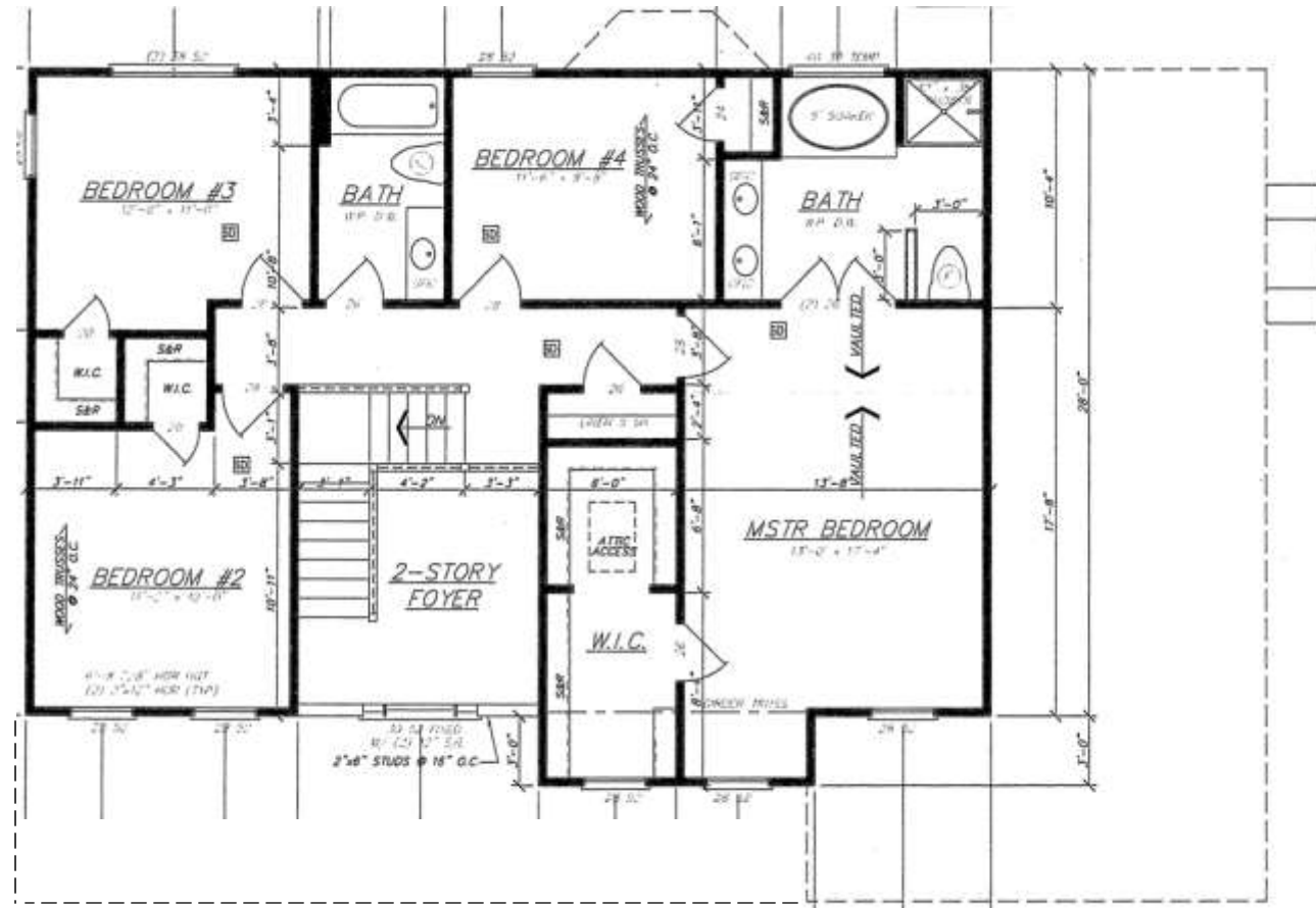
Upper Level Floor Plan

Basement: Full / Finishable Living Space