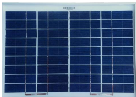
Fig.1. Solar panel

We are using here a solar panel of 10 watts having dimensions 300*350*22.