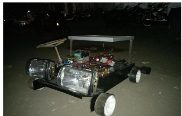
Fig 6. Prototype model front view