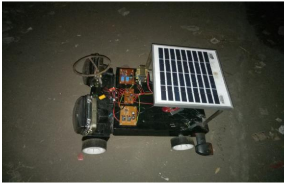
Fig 7. Prototype model top view