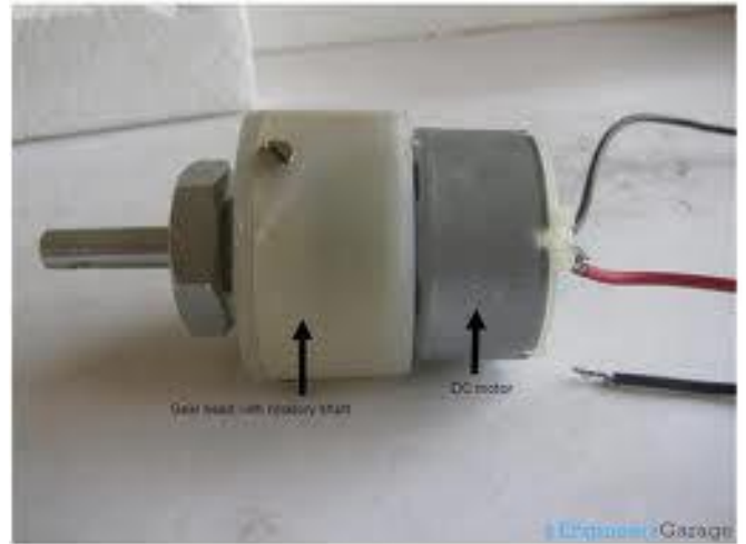
Fig 2. DC Servo motor

The DC servo motor is a rotary electrical machine that converts direct current electrical energy in the form of mechanical energy. Normally all the DC motor having same internal mechanism, either electromechanical or electronic. A speed of DC motor can be controlled over a wide range.