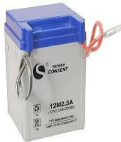
Fig 3. Battery

Here we are using Lithium-ion battery which having long life cycle as compare to Ni-Cd batteries. We are using 12V, 2.5 Ah batteries for vehicle operation.