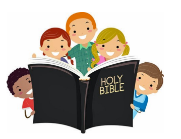
Read God's Word

There is a nursery at the rear of the auditorium up the stairs if you need to care for your infant.