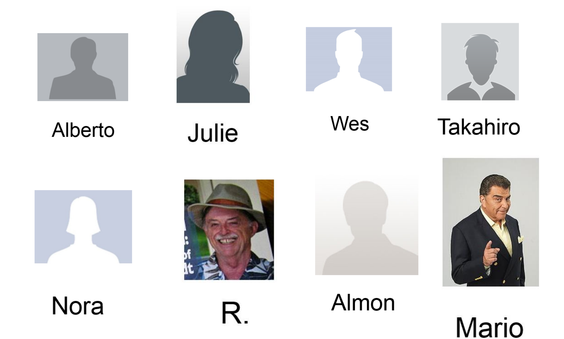
The SLA Hall of Fame