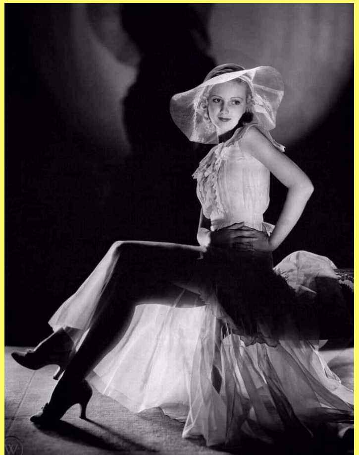
June Lange Minneapolis girl on the big screen

Born 1917 as Winifred June Vlasek in Minneapolis, Minnesota, American actress June Lang made her film debut in 1931, with much of her early work coming in minor roles in musical and dramatic films. She caught the eye of Darryl F. Zanuck at 20th Century Fox, gradually securing second lead roles in mostly B movies. Her debut feature film role came in Young Sinners . Noted for her fragile and demure appearance, Lang was usually cast as the little sister or the heroine's best friend in light comedies and adventure films. She soon graduated to leading roles, most notably in Bonnie Scotland (with Laurel and Hardy, 1935), in The Road to Glory (with Fredric March, Warner Baxter and Lionel Barrymore, 1936), and as Joyce Williams in Wee Willie Winkie (with Shirley Temple, Cesar Romero, and Victor McLaglen, 1937). Lang semi retired from acting in 1947, after struggling as a free lancer to re-establish her film career for several years. She occasionally appeared in minor roles on television. She died in 2005 in Valley Village, California at the age of 88.