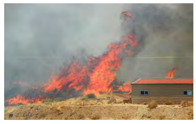
Lomita Fire, Hwy. 180 Bypass, May 2011

There's good news about wildfire. It rarely comes as a surprise. In the