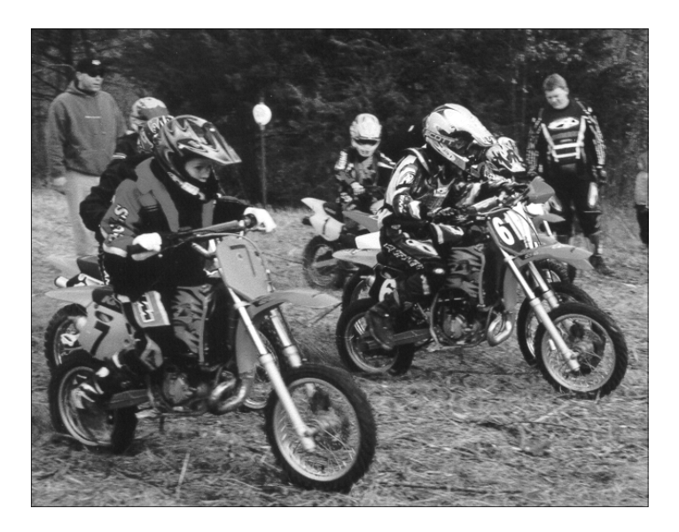
The start of the Pee Wee race. These kids are pretty intense.

stopped to help, she told him to get back out there.