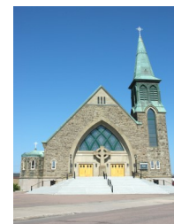
Saint Augustine's 340 Dominion Street Moncton, NB E1C 6H8

December 1st, 2019 First Sunday of Advent