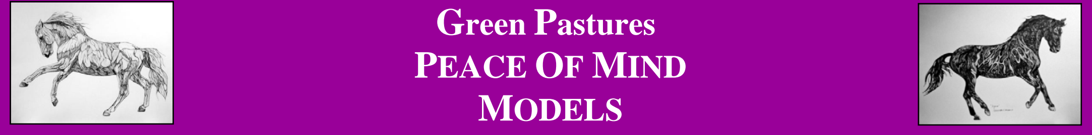
Chart 17: Peace Of Mind Models Performance Summary

Hypothetical Backtest Performance (Jan-2008 to Mar-2023)*