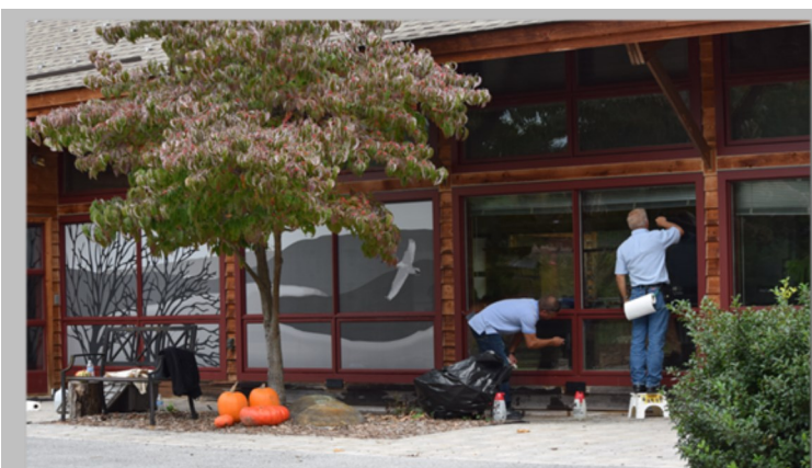
Installation of the CollidEscape on the front of Shuster Hall.