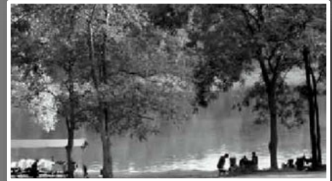
Photo Top: Putt's Camp provides a shelter with fireplace for group meals and social activities. Photo Bottom: Two Adirondack shelters provide camping opportunities in addition to grass and wooded area campsites.