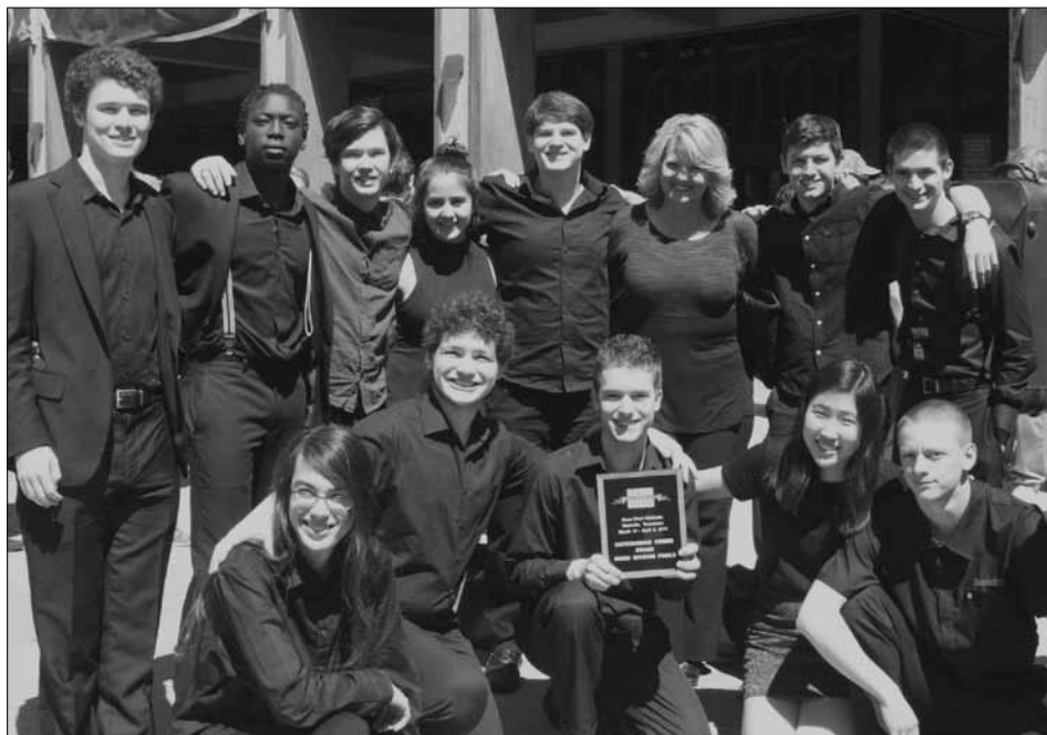
Members of The Amazing Technicolor Show Band show off the Best Band Award they received for their performances during the competition.