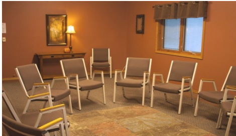
Women's Group Room