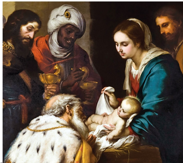
ADORATION OF THE MAGI BY RAFFAELLO ESTEBAN MURILLO