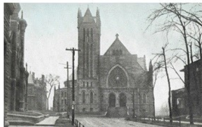
Plymouth Congregational Church

Temple B'Nai Yeshurun was dedicated in 1887 at the SW corner 8 th and Pleasant where they were for 45 years. In 1932 the present Temple on Grand Ave. and Country Club Blvd was dedicated.