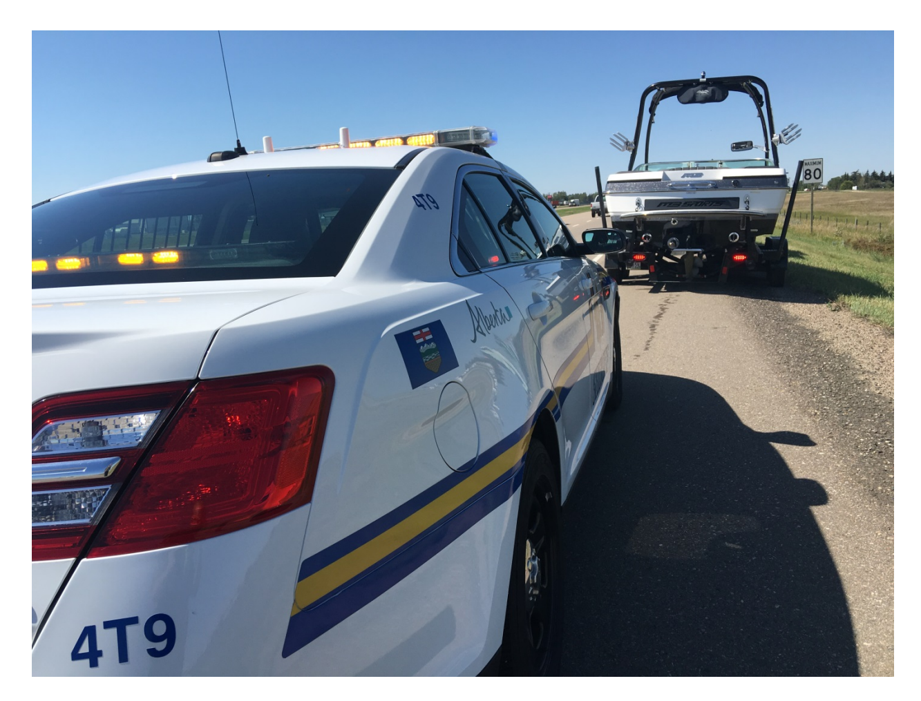
Photo 5: Expect to be inspected! Watercraft inspections are mandatory for all passing watercraft, including motorized, non-motorized and commercially hauled