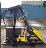
Transportation Skid Options