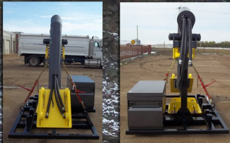
Custom Transport Skid For Safe Hook Up and Storage