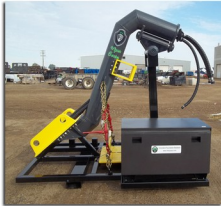
Custom Tool Box Can Be Added

Innovative Foundation Solutions' is pleased to introduce our Viper and King Cobra screw pile head Jib line.