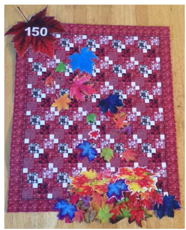
It's going to look great, Debbie.

The finish deadline is our January 12 meeting. If you can't make that meeting, drop off your completed kit at the Ouilted Raven.