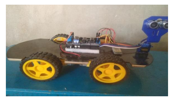
Fig. 5. Image of robotic control vehicle with MPU6050 Controller – Side View

Fig. 4. Image of robotic control vehicle with MPU6050 Controller – Top view