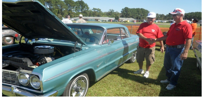
Harry's 64' Chevrolet SS