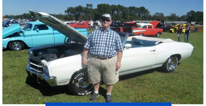
Ted's 70' Chevelle